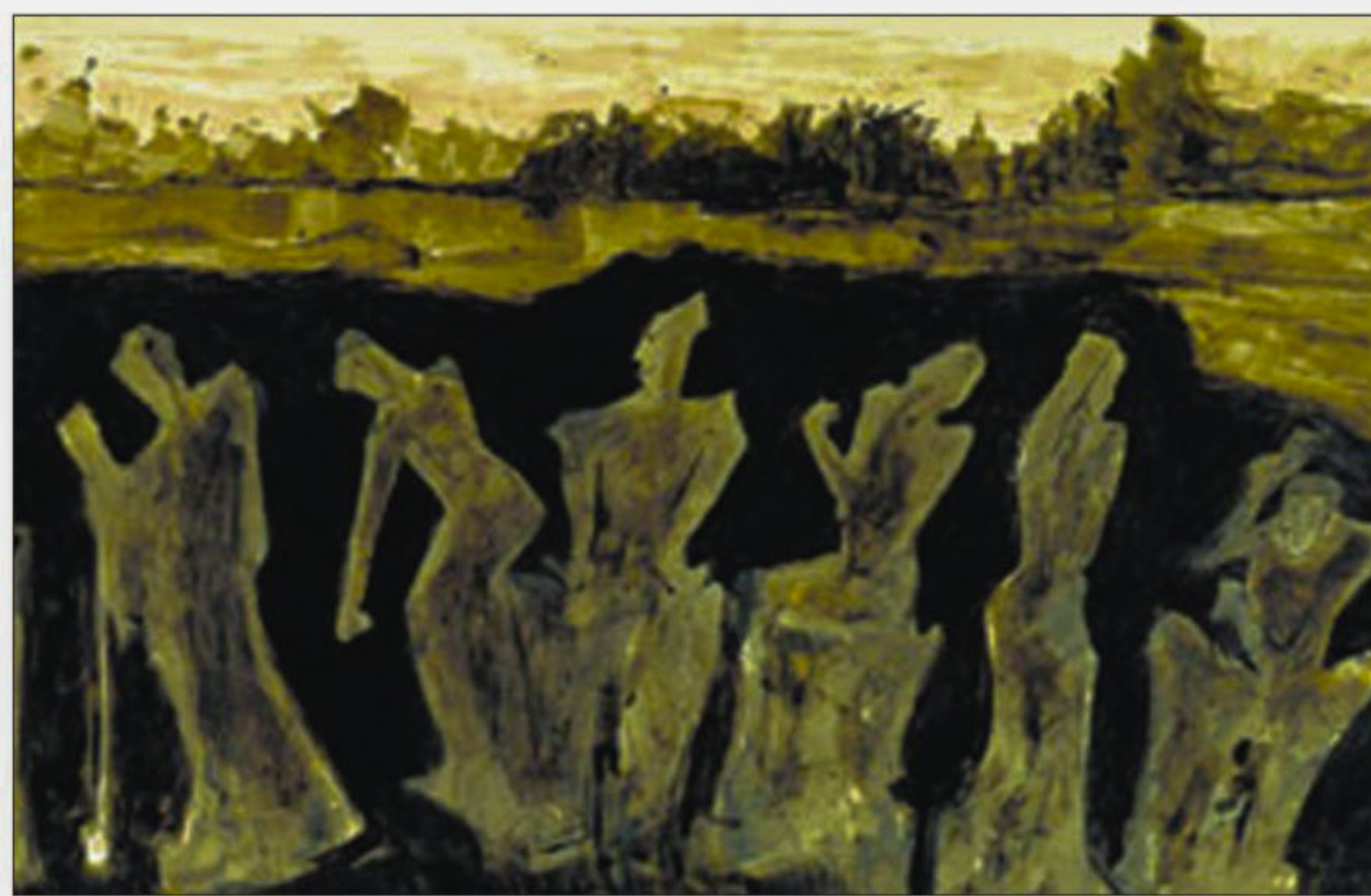
One of the 12 paintings of Rabindranath Tagore to be auctioned by Sotheby's in London.

A British auction of paintings belonging to Rabindranath Tagore has caused national outcry in India, who believe the "world heritage" works should be returned to the country.