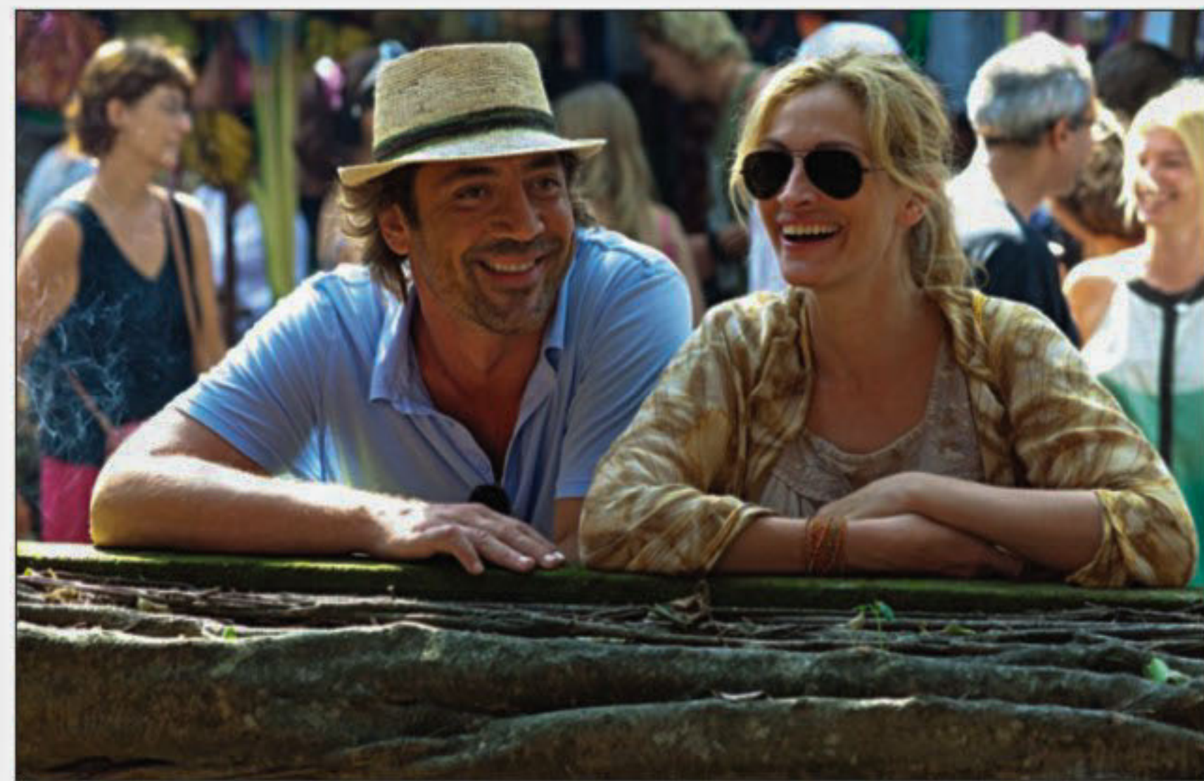
Javier Bardem and Julia Roberts in "Eat Pray Love".