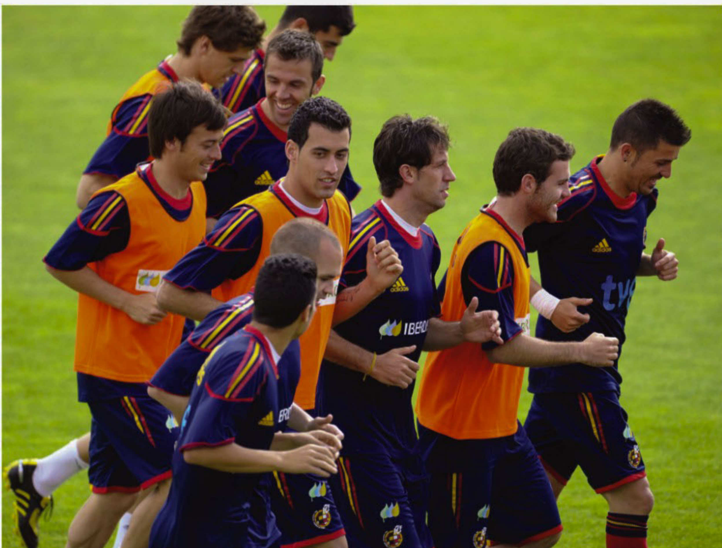
Spanish players jog during a training session at the Sports City of Las Rozas on Tuesday.

Aside from the Swiss Spain will also face Honduras and Chile in the finals.