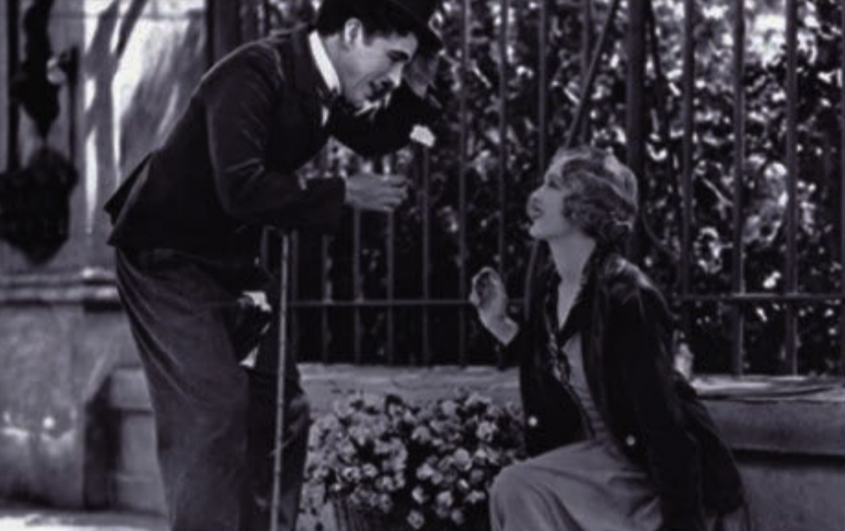
A scene from "City Lights," one of the Chaplin films to be screened at the event.