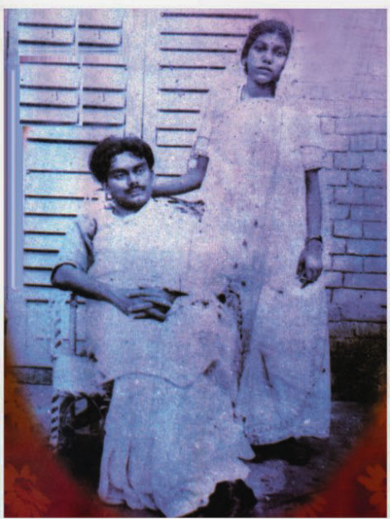
Nazrul Islam with Promila Debi