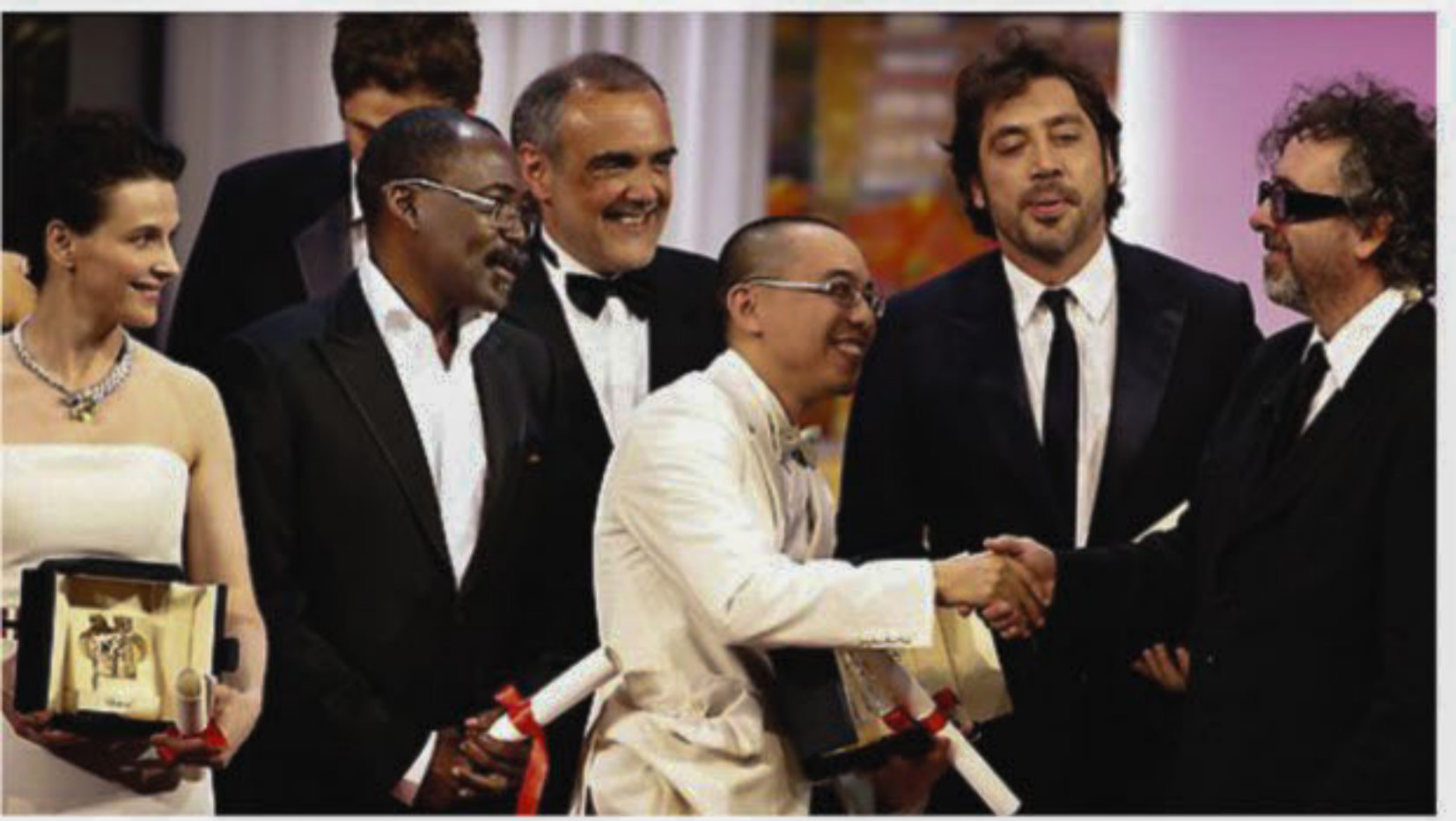
Apichatpong Weerasethakul (centre) winner of the Palme d'Or, with Tim Burton (far right), Juliette Binoche (far left) and Javier Bardem (second from right) won acting prizes at Cannes.