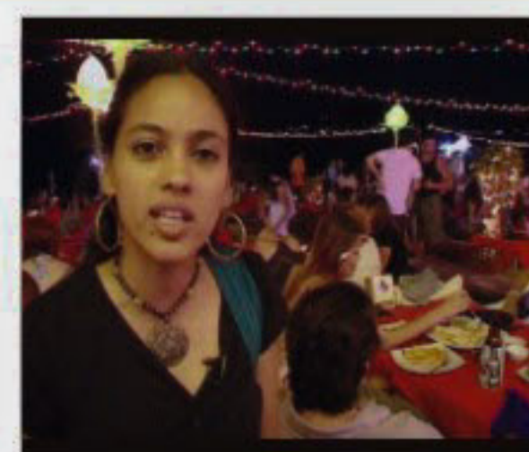
Rexona Destination Unlimited On ATN Bangla at 8:00 pm Travel Show