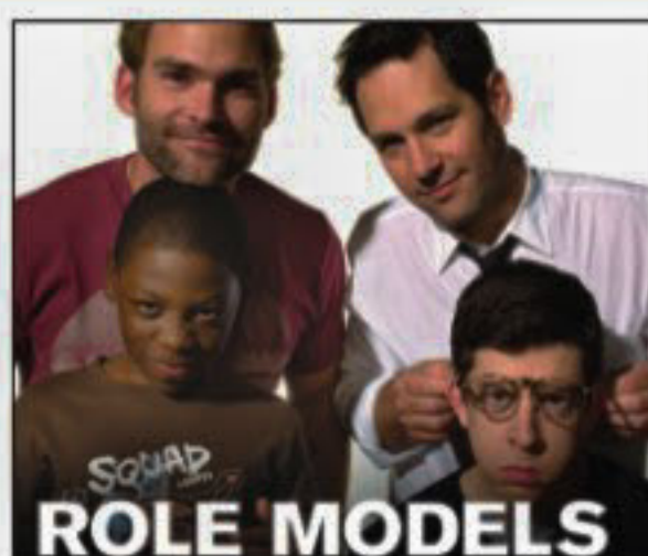
Role Models On HBO at 7:30 pm Genre: Comedy Cast: Seann William Scott, Paul Rudd