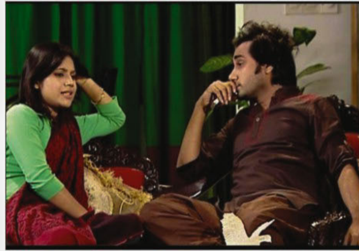
A scene from the serial.

The plot follows Pranto and Maisha, who meet through Facebook. After becoming friends for a while, Pranto starts to develop feelings for Maisha. When Maisha becomes aware of this, she decides to maintain a distance. Maisha grew up watching her parents fighting all the time. Those experiences have left a scar on her psyche and