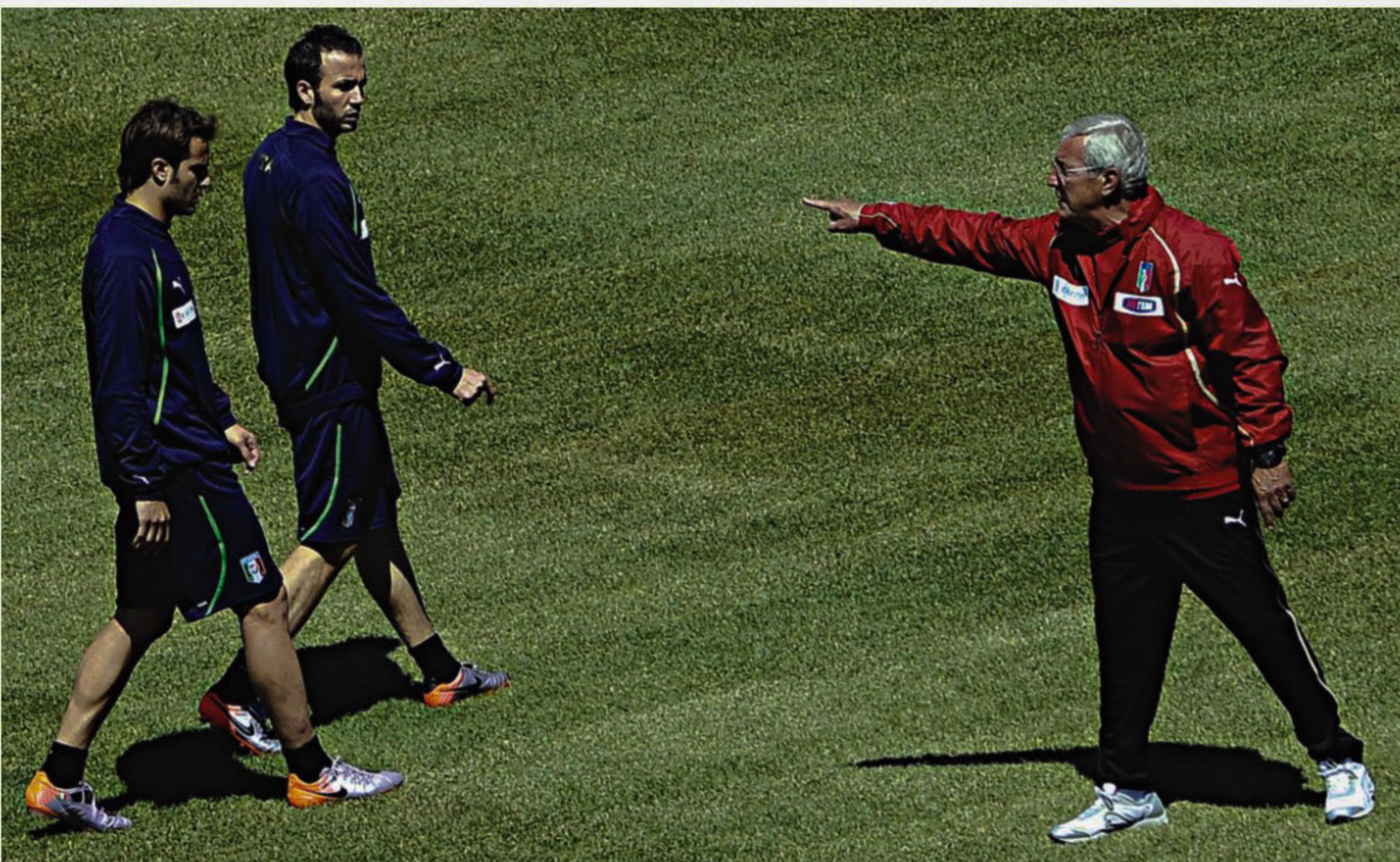
PM IN CHARGE: Italy coach Marcello Lippi (R) gestures as forwards Gianpaolo Pazzini (C) and Alberto Gilardino look on during a training camp in Sestriere on Monday.