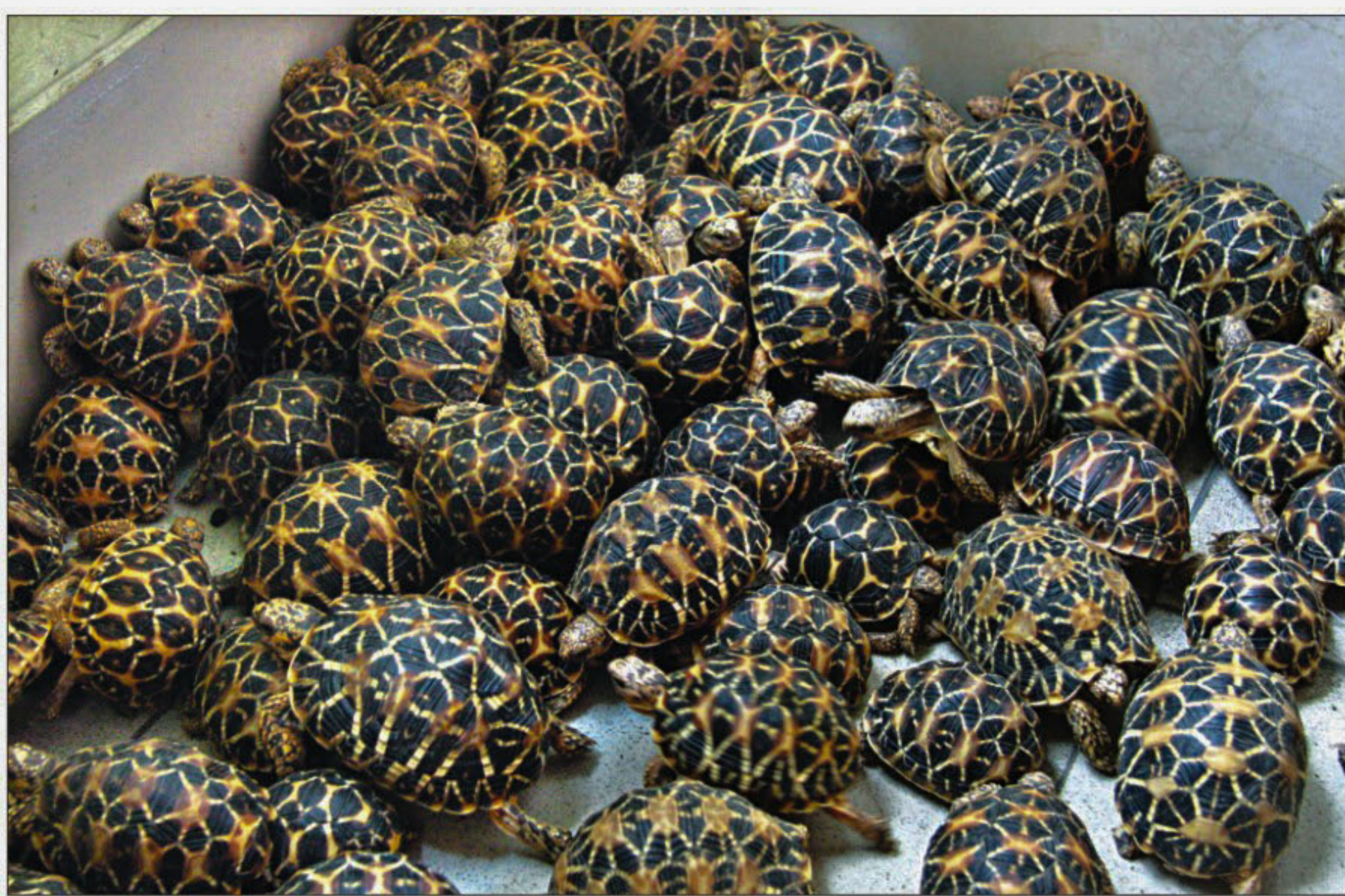
Immigration officials at Hazrat Shahjalal International Airport yesterday recovered these starred tortoises from an Indian national heading for Malaysia.