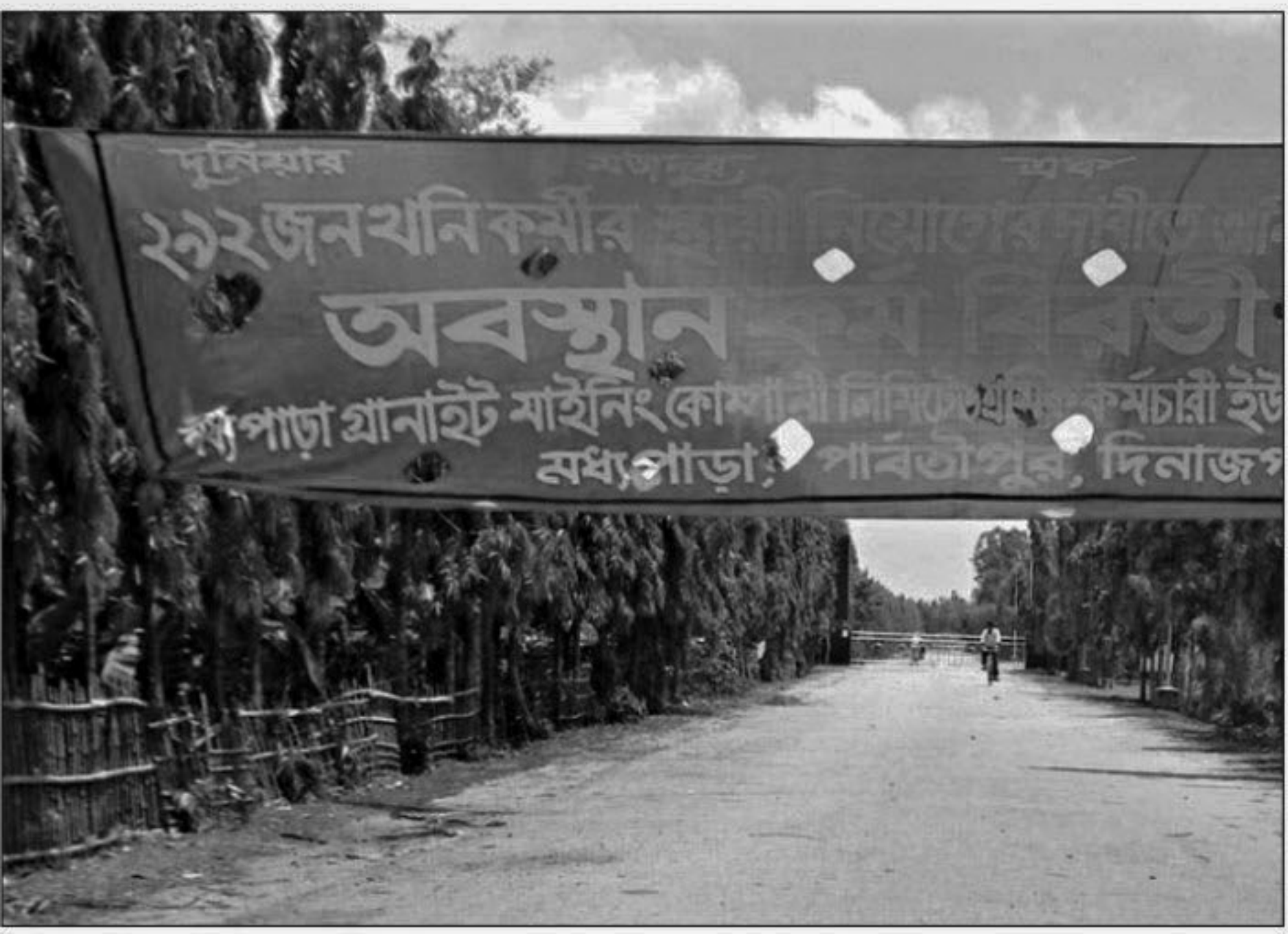
The entrance of Madhyapara Granite Mining Company in Dinajpur gives deserted look as 292 miners, who on Sunday started an indefinite strike demanding regularisation of their job, closed the main gate yesterday.