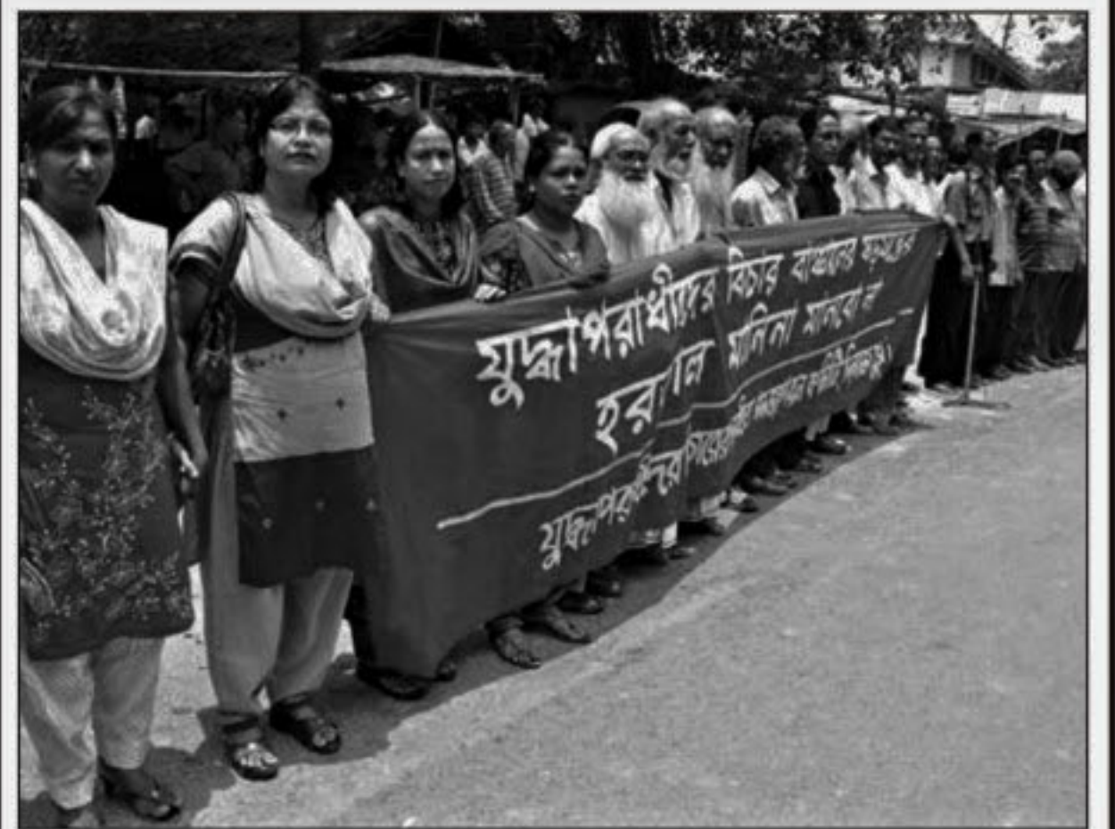
Gonojagoron committee forms a human chain in front of Dinaajpur deputy commissioner's office yesterday demanding trial of the war criminals.