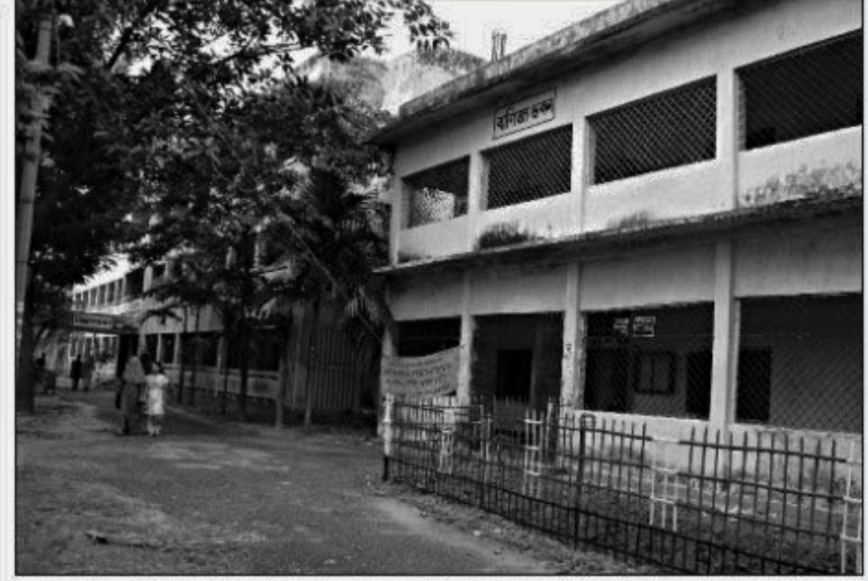
Classes at Lalmonirhat Government College have remained suspended for the last two days as teachers observed work abstention in protest against stalking a female colleague and assaulting another teacher by some unruly students of the college on Saturday.

While filing this report, divers of Rajshahi fire brigade were conducting rescue operation