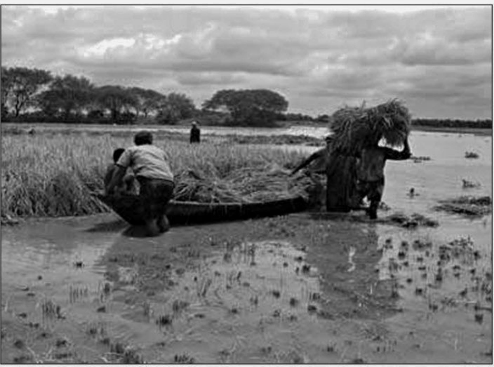
Farmers take onto a boat boro paddy harvested from a field in Shibalaya upazila of Manikganj district as the area went under water after dyke collapse at Kashadaha on Sunday.

Upazila agriculture officer said they asked the farmers to cut the submerged boro paddy immediately. Otherwise, they will face heavy loss, he added.