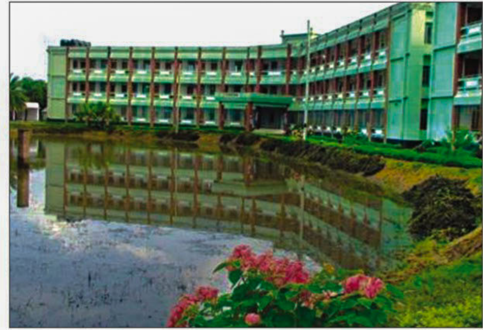
Jatiya Kabi Kazi Nazrul Islam University in Trishal, Mymensingh.

The magnanimity of Nazrul is in fact found in his words. We also expect the image of the university to be embellished with extensive research works on Nazrul's life and literature.