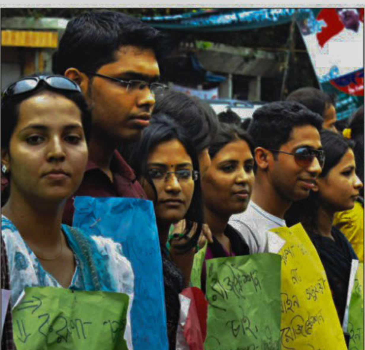
New pharmacy graduates form a human chain in front of the National Press Club in the city yesterday demanding registration according to the Pharmacy Ordinance 1976. Bangladesh Pharmaceutical Society (BPS), Pharmacy Graduates' Association (PGA) and Swadhinota Pharmacist Parishad (SPP) organised the programme.