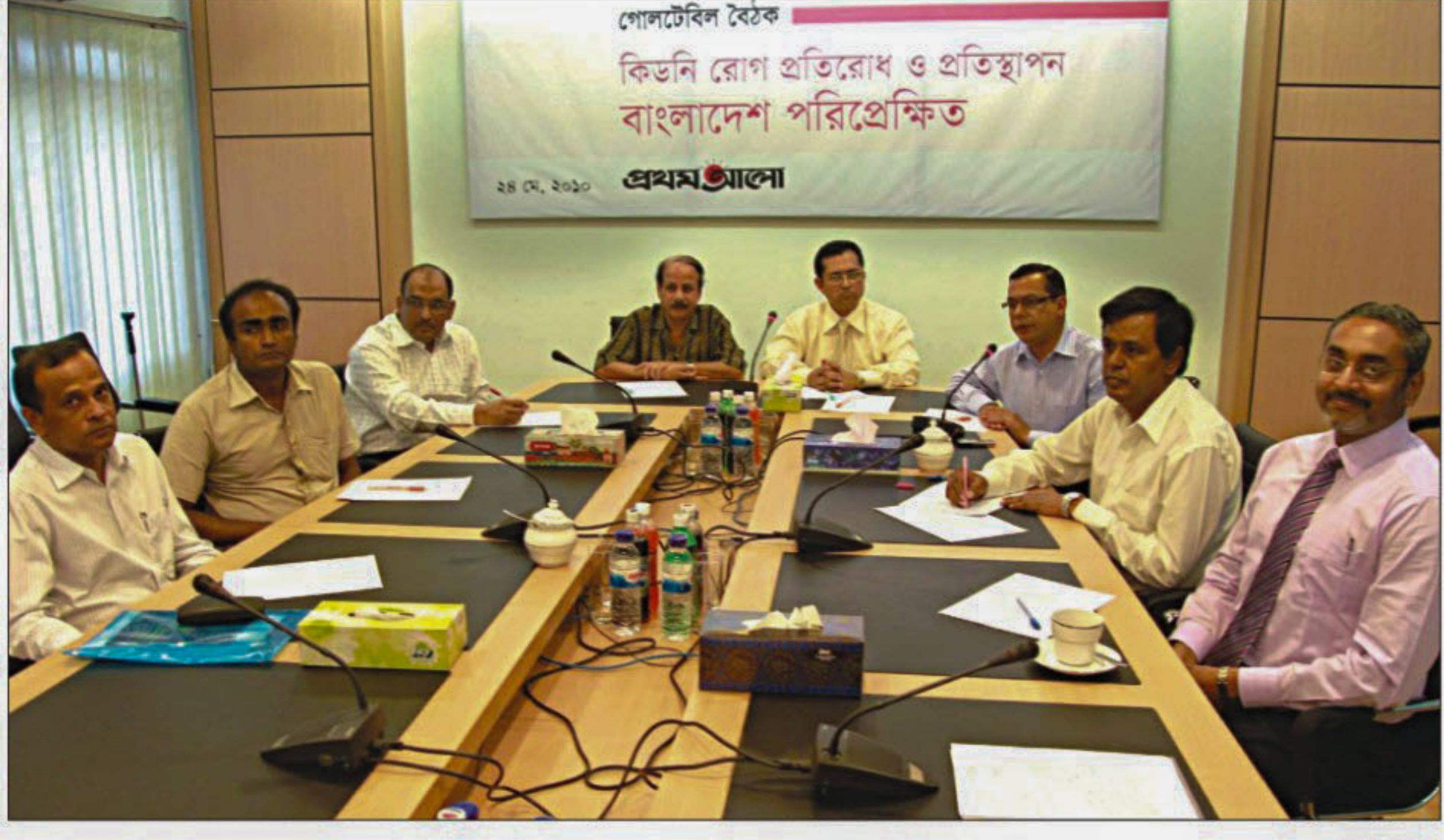
Discussants at a roundtable on 'Kidney disease and transplant' organised by the Prothom Alo at its office in the city yesterday.