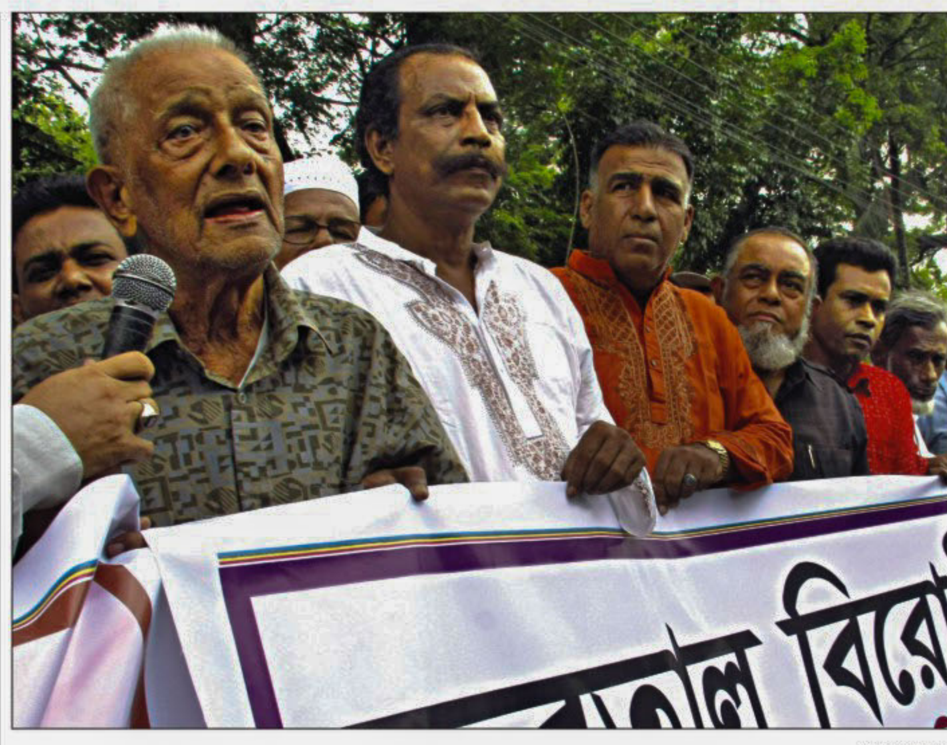
Members of civil society form a human chain in front of the National Press Club in the city yesterday protesting June 27 hartal called by opposition BNP and demanding its withdrawal by June 10.