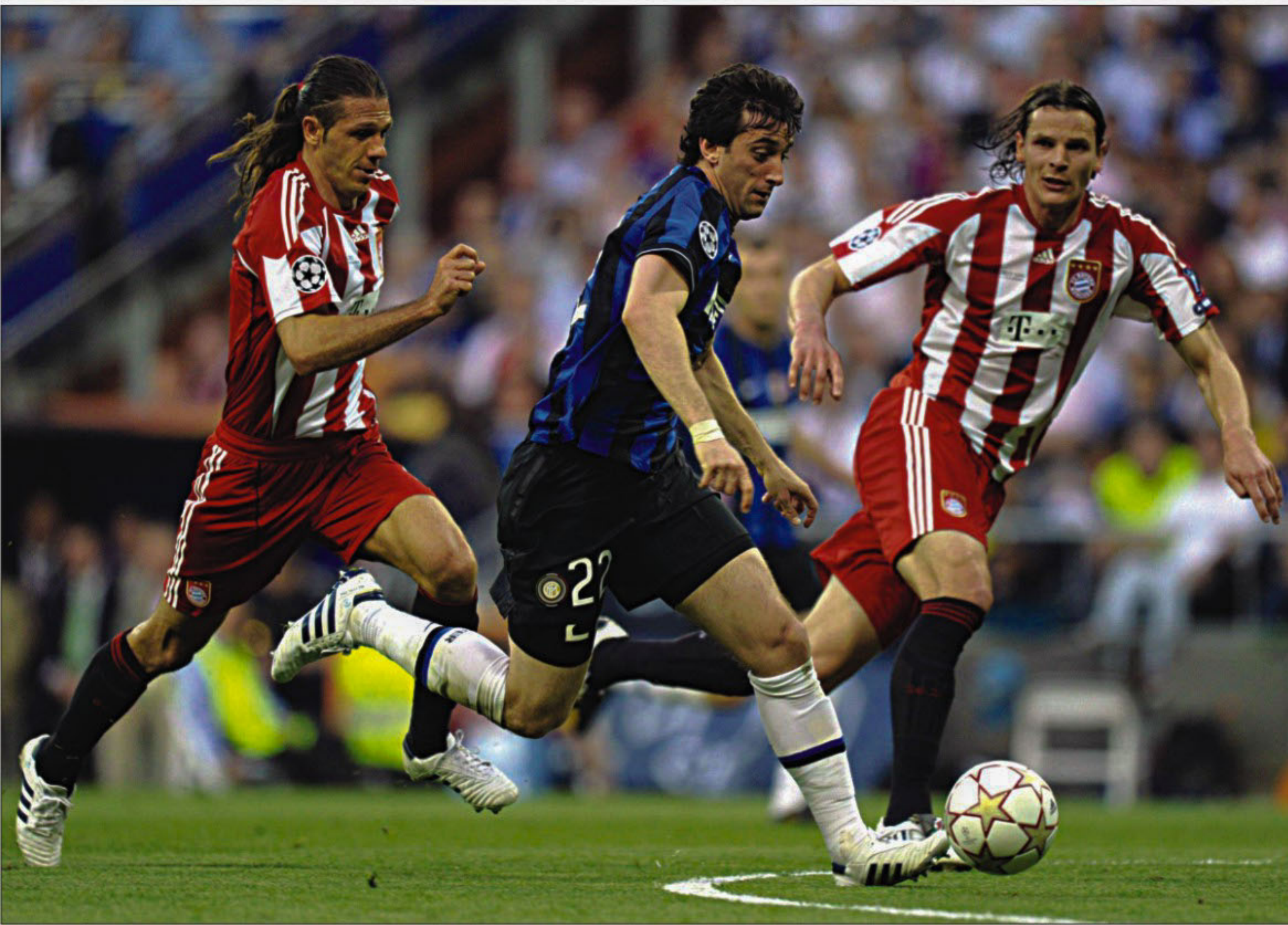
AS EASY AS 1-2-3: Striker Diego Milito (C) is about to score Inter Milan's first goal of the Champions League final against Bayern Munich at the Santiago Bernabeu in Madrid on Saturday.