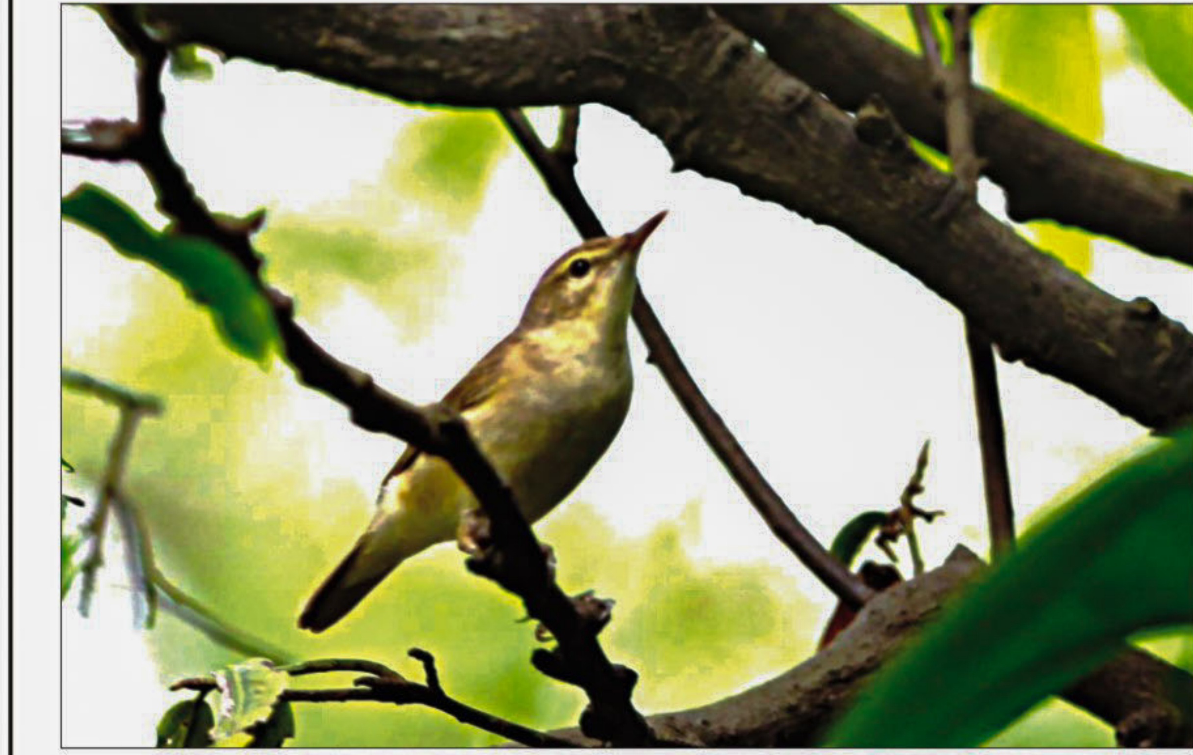
Radde's Warbler, one of the rarest migratory birds of Bangladesh, was sighted in the National Botanical Garden in Dhaka recently. There are just two records of its sightings in the country in past century or so.