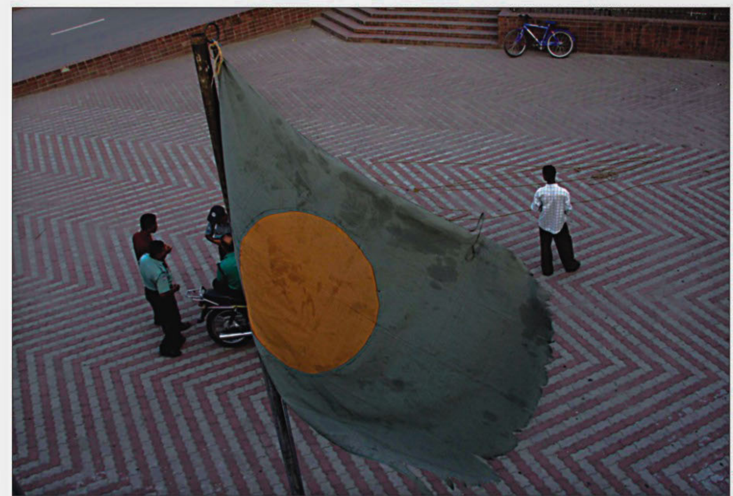
The national flag flying in the police camp at Hazrat Shahjalal International Airport recently is tattered and discoloured, raising questions about the camp authorities' respect for it.