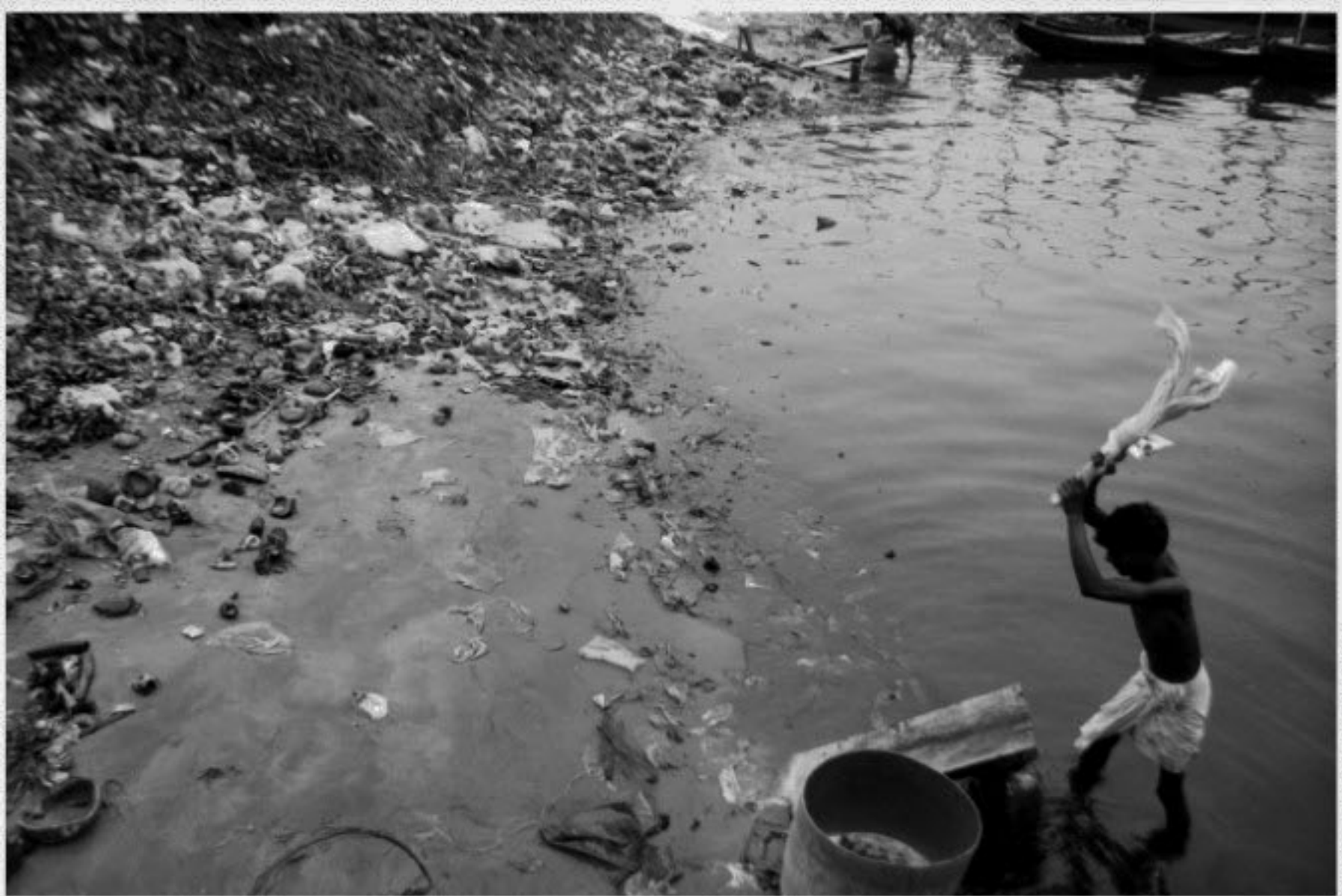
AMADULL HUQ / DRINKNEWS