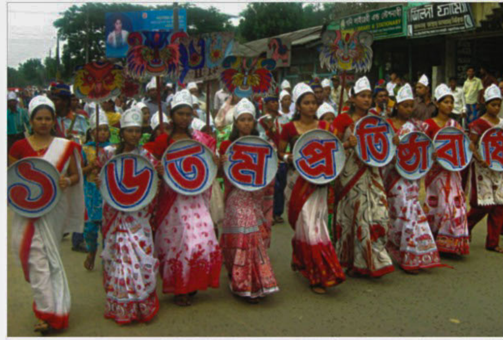
A rally was brought out by Sanaton Chhatra Jubo Parishad on the occasion.

Earlier, a rally brought out by the organisation, paraded the main roads in the hill town to mark its 16th anniversary.