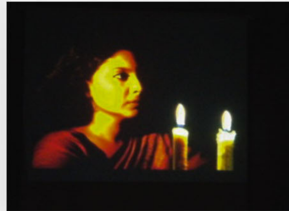
A scene from the short film "Anon-e Onno Agun" that was screened at the event.