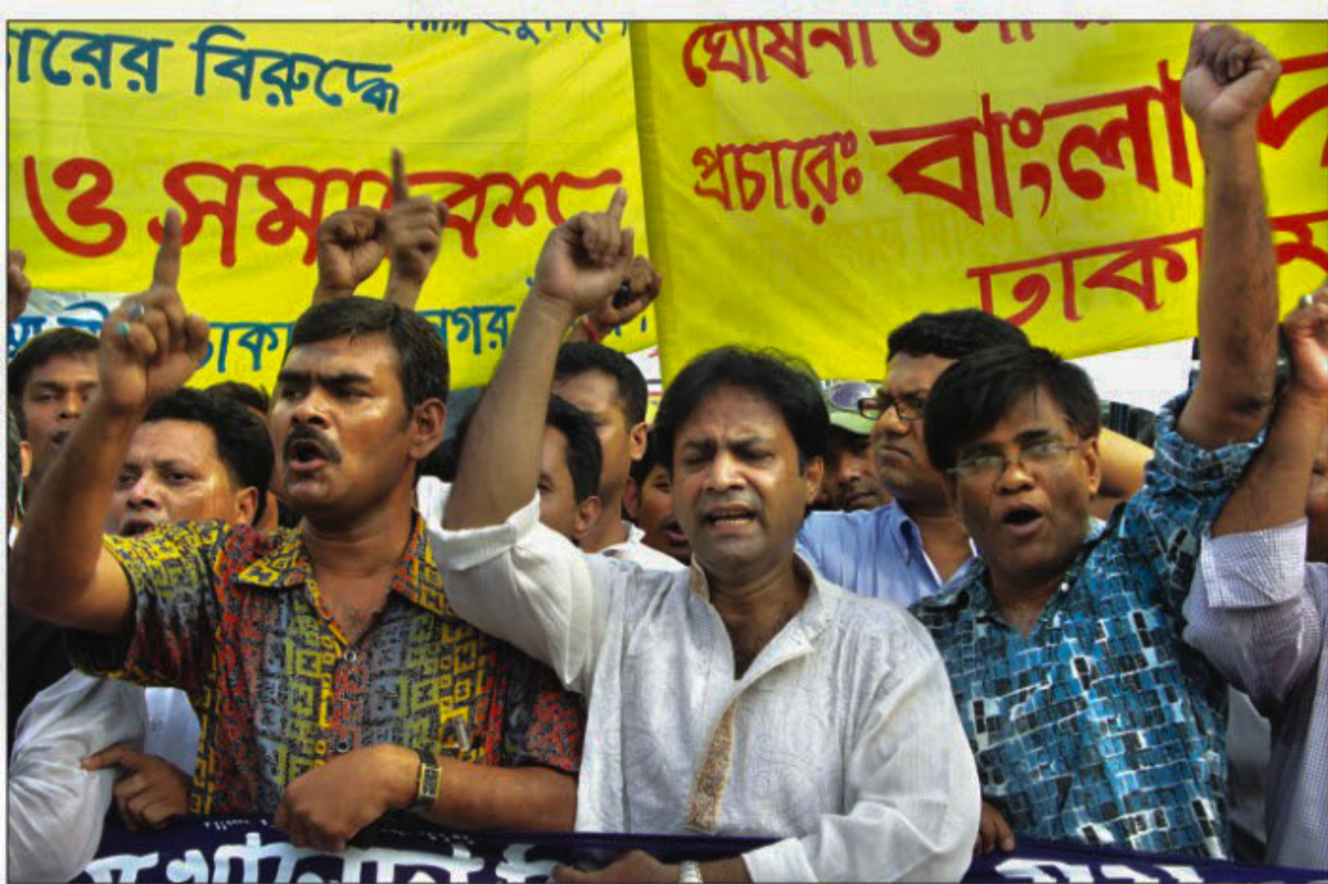
Awami Muktijodha Projanma League stages a demonstration at Bangabandhu Avenue in the city yesterday protesting June 27 hartal called by Bangladesh Nationalist Party (BNP).