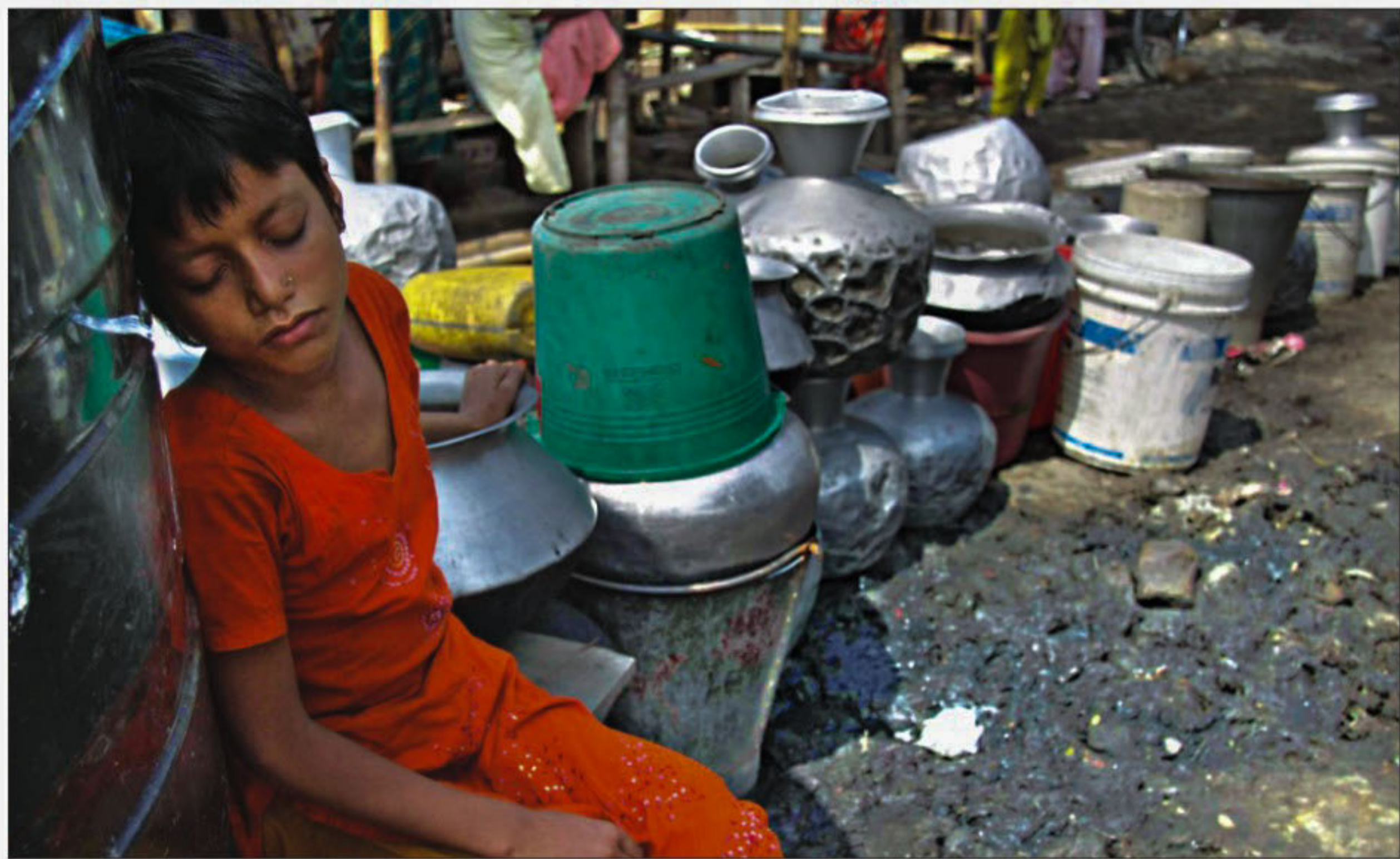
A girl falls into sleep while waiting for a long time to collect drinking water at Basila in Mohammadpur in the city yesterday. Severe water crisis has gripped many areas of the city.