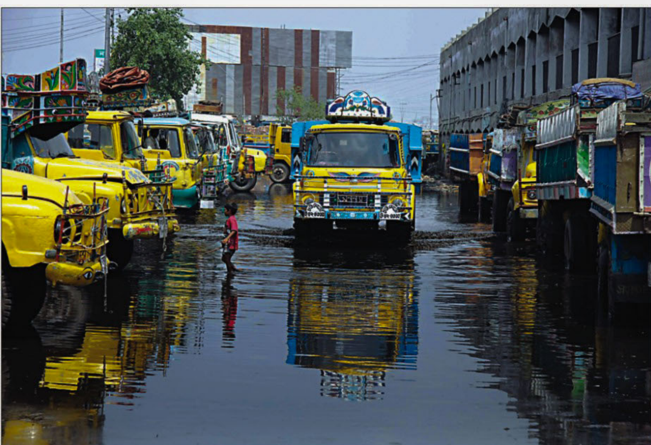
Waterlogged Gabtali cattle market in the capital yesterday. The market lacks a proper drainage system, resulting in recurrence of the scene whenever it rains.