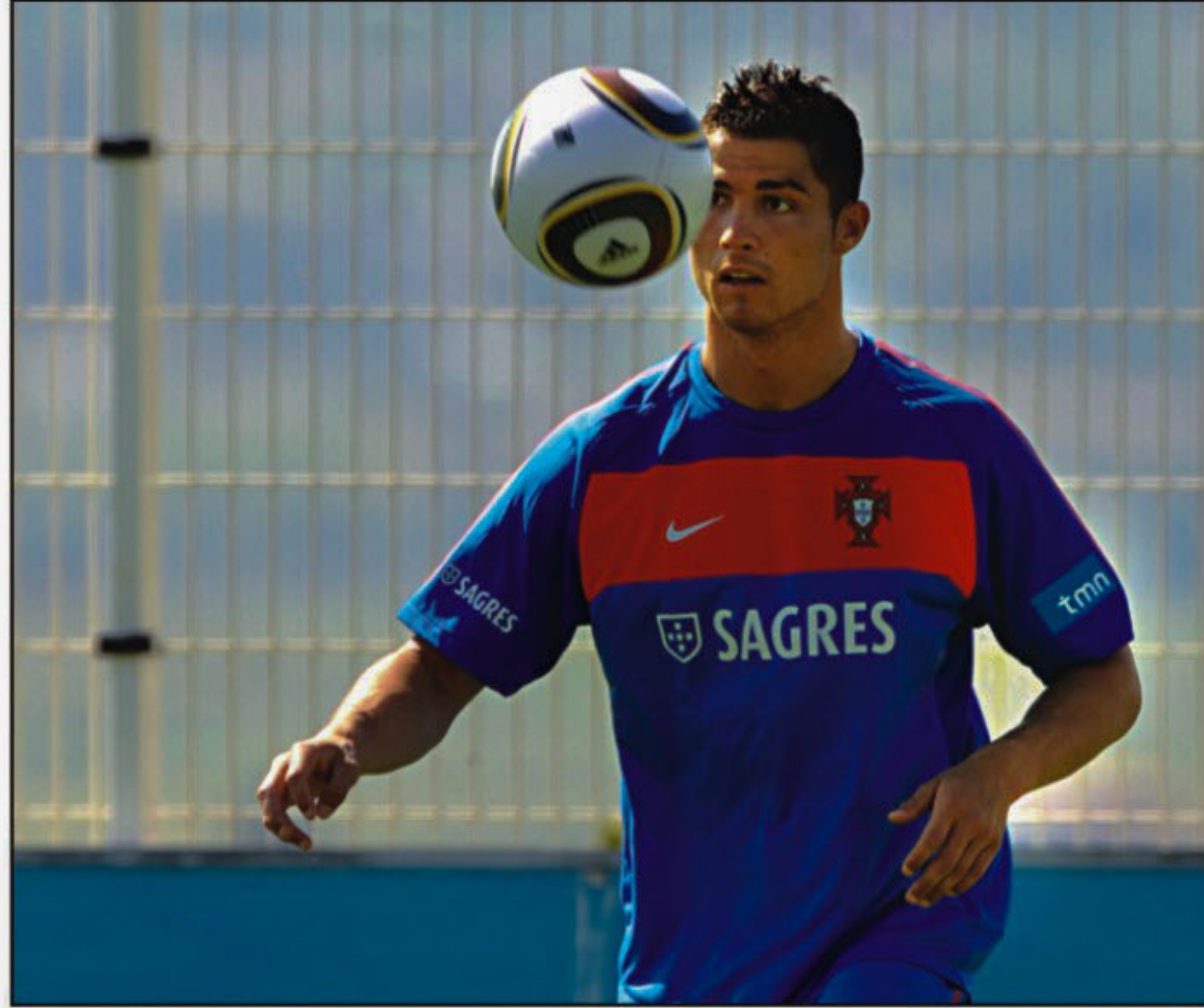
Portugal star Cristiano Ronaldo eyes the ball during their morning training session at the Covilha Sports Complex on Saturday.

always do, be it for my club or country. I will be motivated." Portugal are up against Brazil, Ivory Coast and North Korea in Group G, kicking off against the west Africans on June 15 in Port Elizabeth.