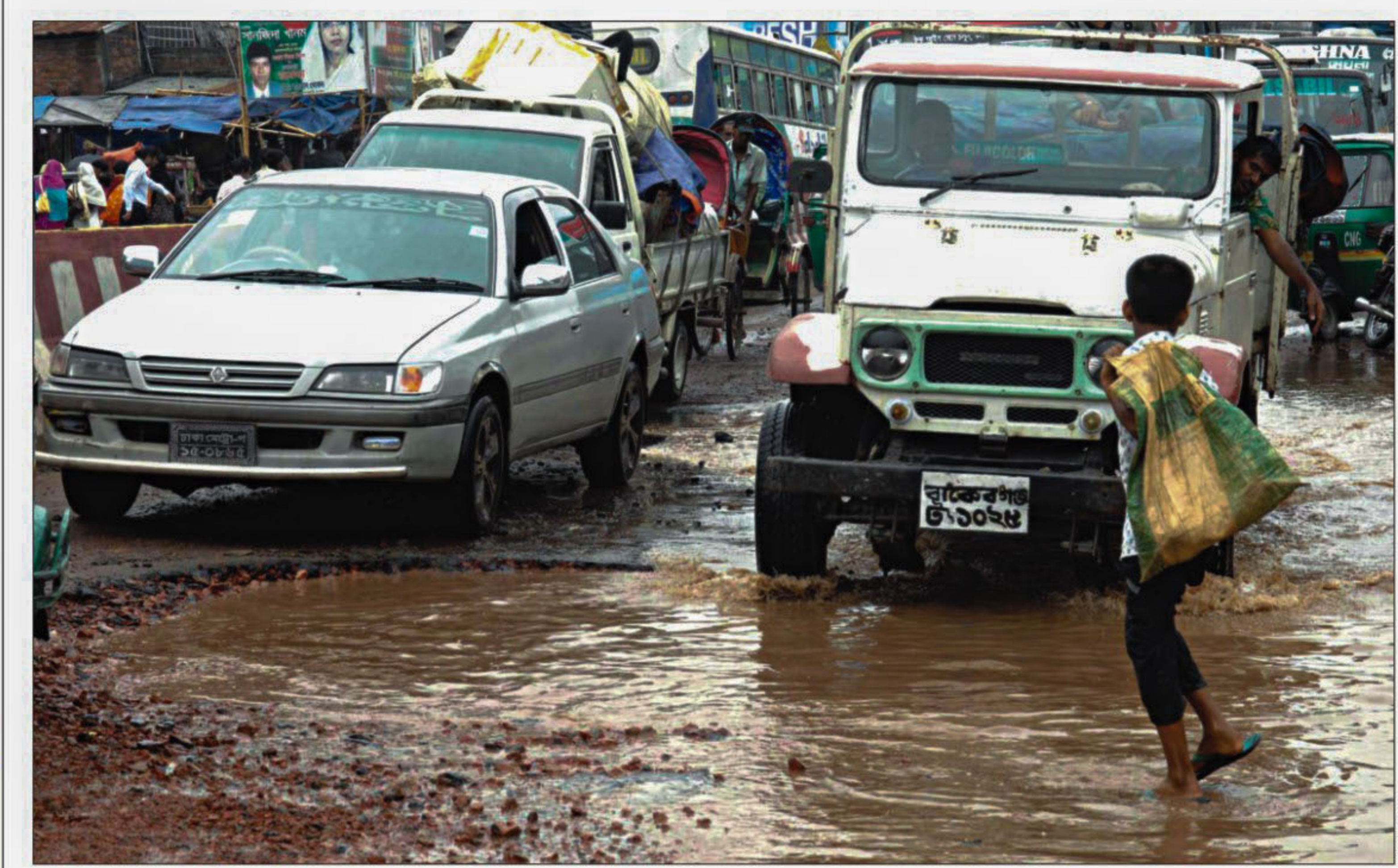
The condition of this road near Jurain Level Crossing in the capital has been in this sorry state for quite a long time, causing accidents frequently, locals said.