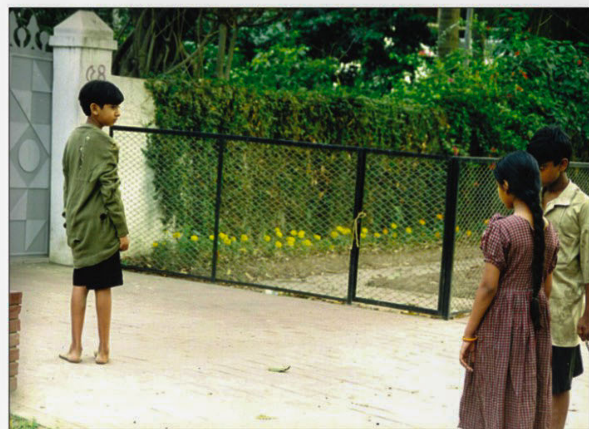
A scene from "Duratto", one of the films to be screened at the festival.

Other films to be screened at the festival include "Dipu Number Two", "Duratto" and "Sharat '71" (Bangladesh); "Two Brother" and "The Crocodile" (Germany); "Children of Heaven" (Iran); "Pa" and "Ek Akash" (India).