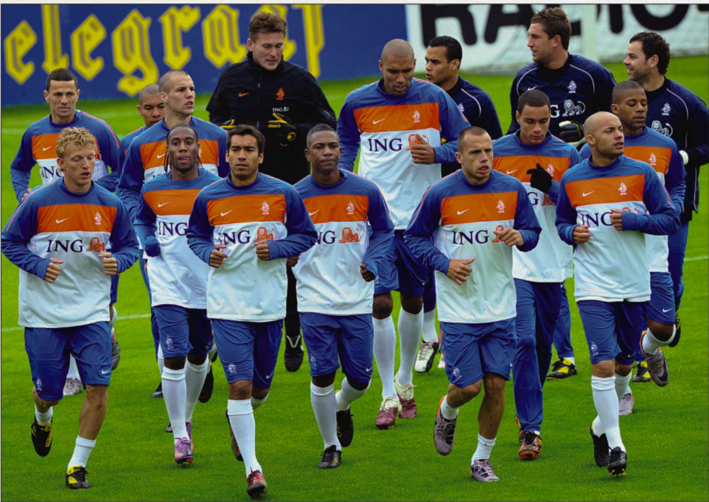
Dutch players jog during their first practice session at their training camp in Seefeld on Thursday.