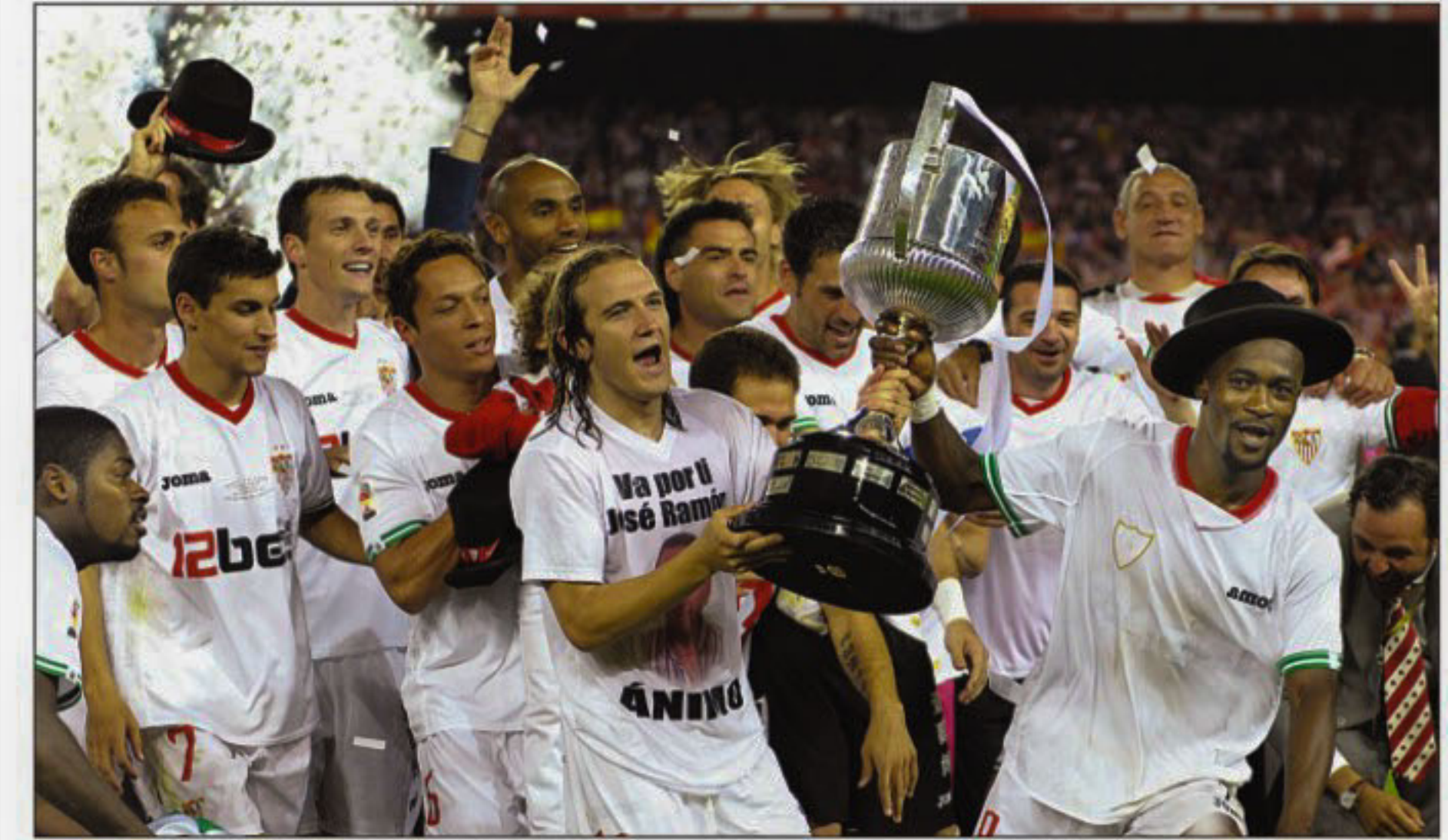
Sevilla players celebrate with the Spanish King's Cup after defeating Atletico Madrid in the final at Nou Camp on Wednesday.

"My players put in an impressive effort," he said. "They gave everything they had, but congratulations nevertheless to Sevilla."