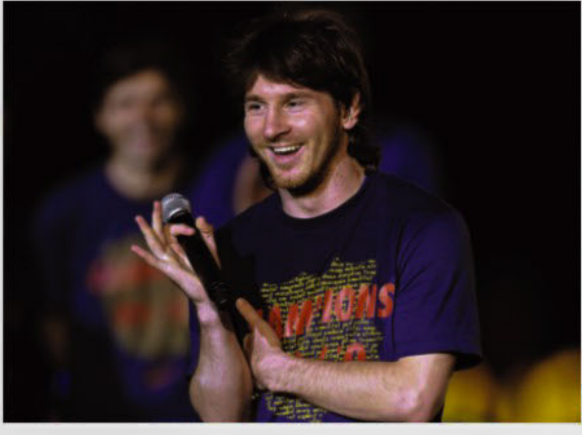
Will Messi be able to carry his fabulous club form into his national team Argentina in next month's World Cup?

play for Barcelona who are one of the most important teams in the world and where it is obligatory to always win." Messi, who flew in to join up with his fellow squad members and coach Diego Maradona, said he thought that Argentina could surprise many and lift the World Cup for the third time in their history. "For me, Argentina is a serious candidate for the title even if nobody puts us among the favourites." "And I believe that is a good thing for us." Argentina are in Group B along with 2002 semifinalists South Korea, African heavyweights Nigeria and Euro 2004 champions Greece.