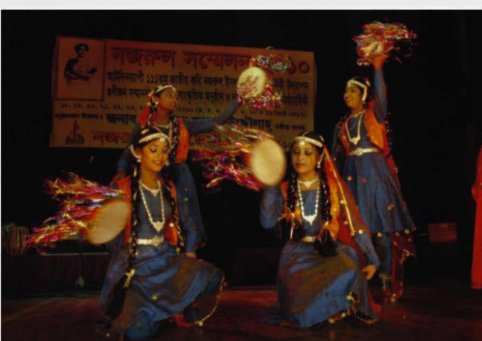
A dance performance on the inaugural day of the convention.