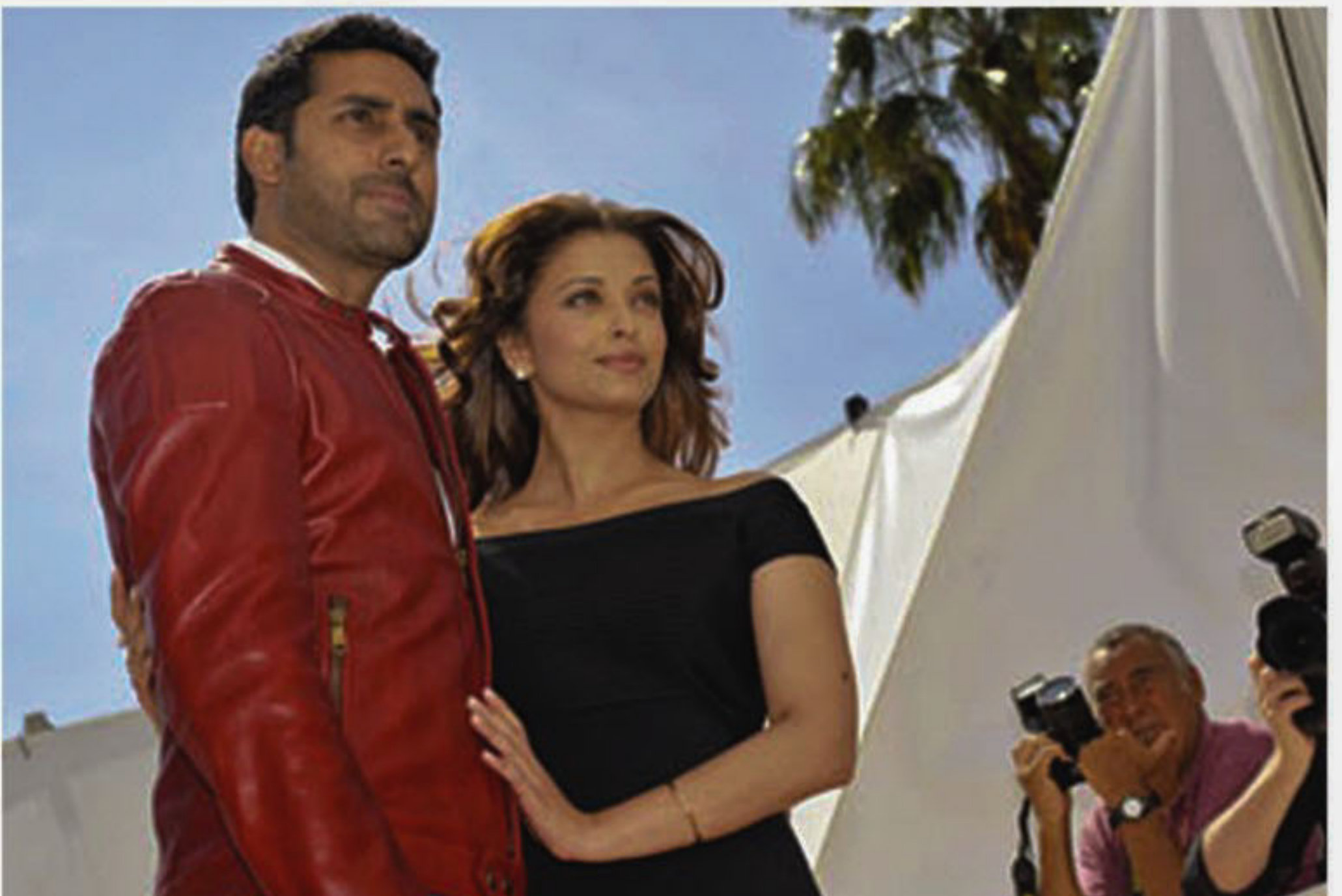
Abhishek Bachchan and Aishwarya Rai in Cannes, France.