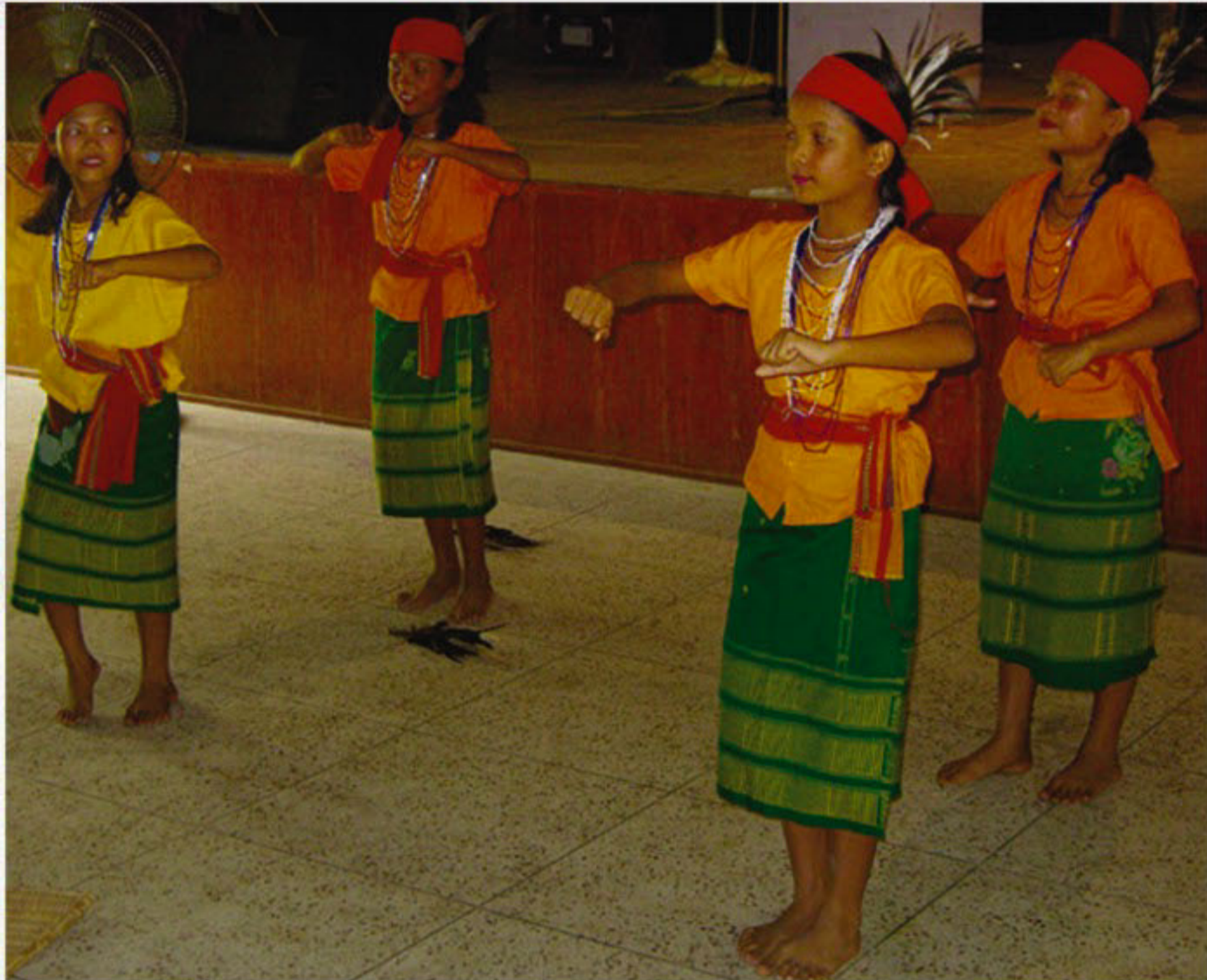
Young indigenous dancers perform at the programme.