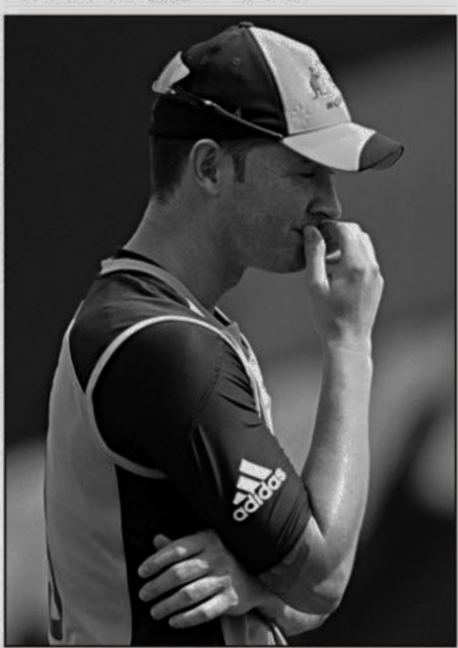
Australia skipper Michael Clarke reacts after losing the ICC World Twenty20 final against England at the Kensington Oval in Bridgetown on Sunday.

More powerful hitters for Australia's top order were largely able to cover for Clarke's lack of runs and with remarkable frankness, he told reporters: "There's no doubt the selectors will need to have a look at my performances."