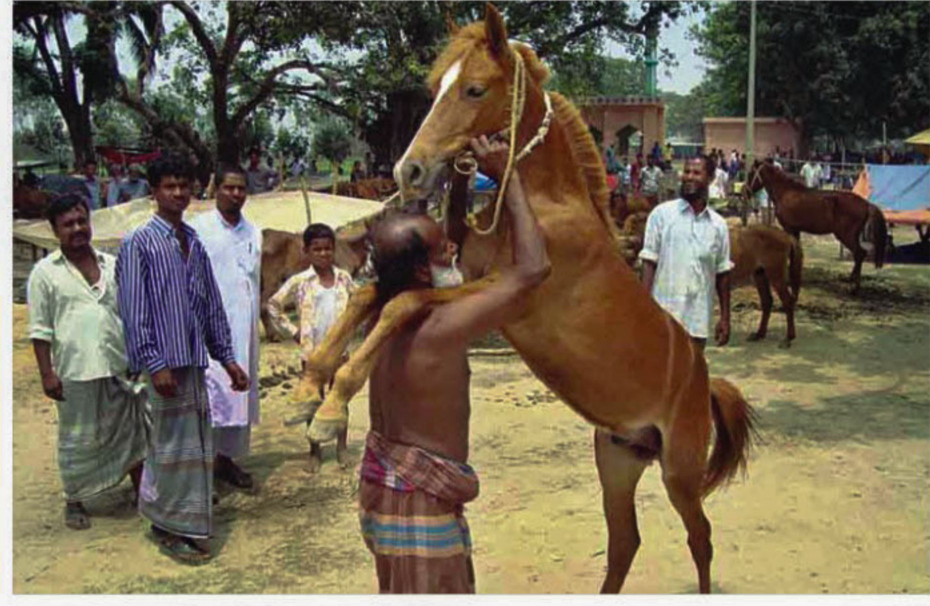
The fair was held at Melabari-Hat in Dinajpur.

The animal lovers demanded that adequate arrangements be made for the livestock that are brought here for display from various parts of the country.