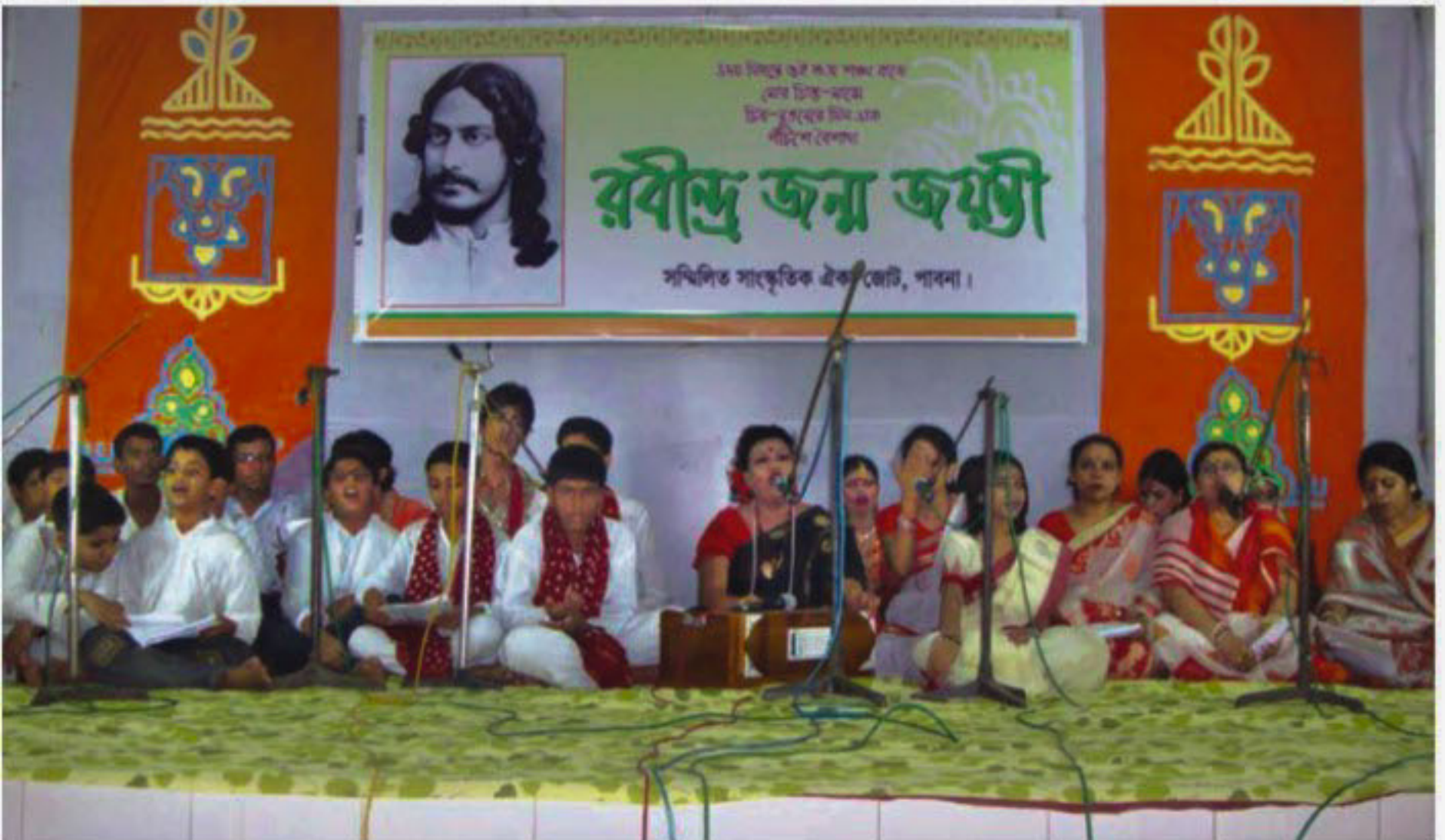
A group rendition at the programme.