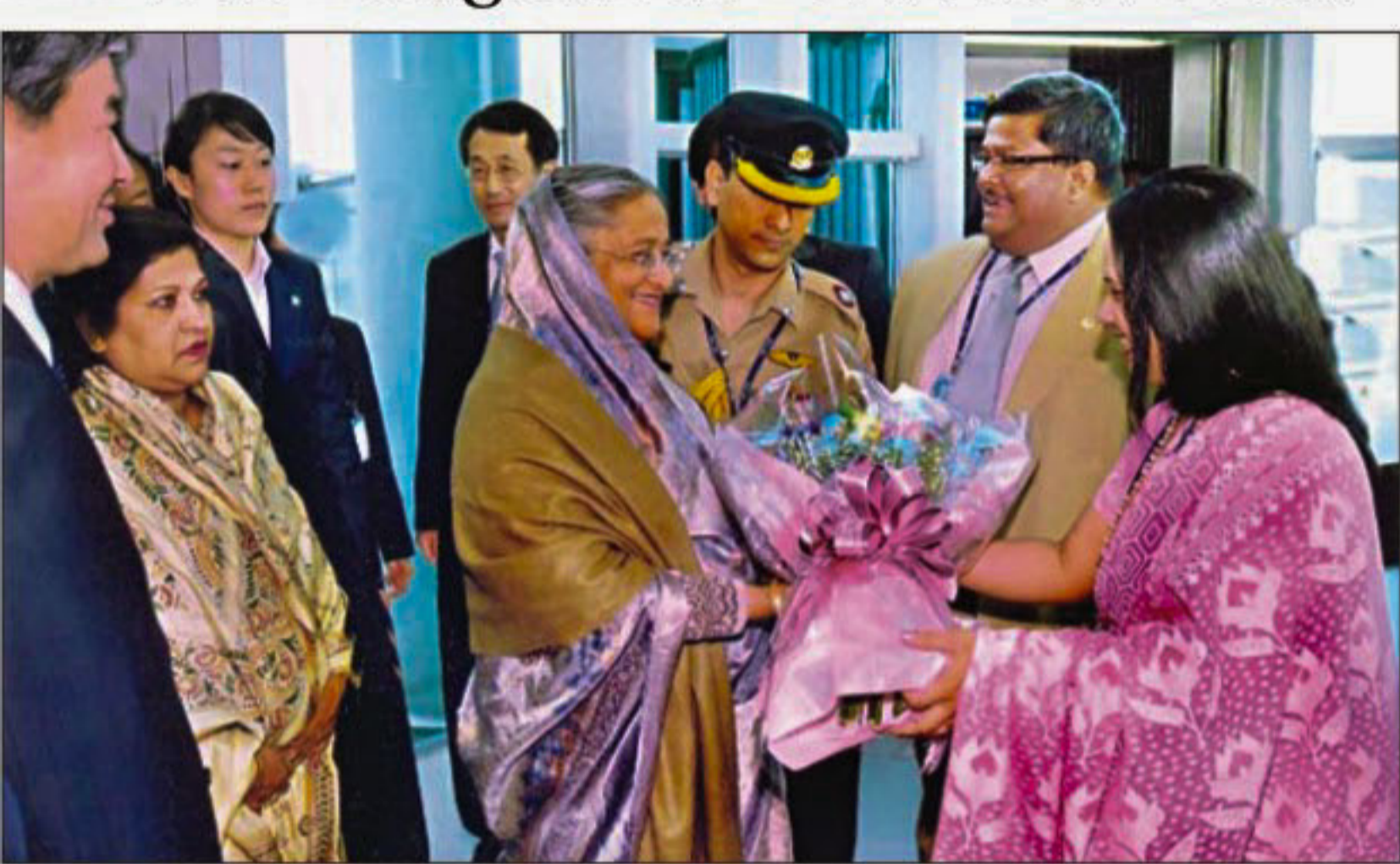
Protocol chief of South Korean foreign ministry, Chotae-Young, and Director General Choichong Moon welcome Bangladesh Prime Minister Sheikh Hasina on her arrival at Seoul airport for a state visit yesterday.

UNB, Seoul Prime Minister Sheikh Hasina, who is in Seoul on a three-day visit, made an impassioned plea yesterday for further enhancement in economic ties between Bangladesh and South Korea. She was addressing the 'Bangladesh Festival 2010', jointly arranged by the Korean labour ministry and the Bangladesh Embassy in Seoul's Jangchung Gymnasium gallery. The premier urged greater export of manpower from Bangladesh to augment the demand for labour in Korea's booming industries, and solicited increased foreign direct investment (FDI) from the Korean private sector in Bangladesh. The PM also urged the Korean authorities to increase imports of various products from Bangladesh to offset the imbalance in trade between the two countries.