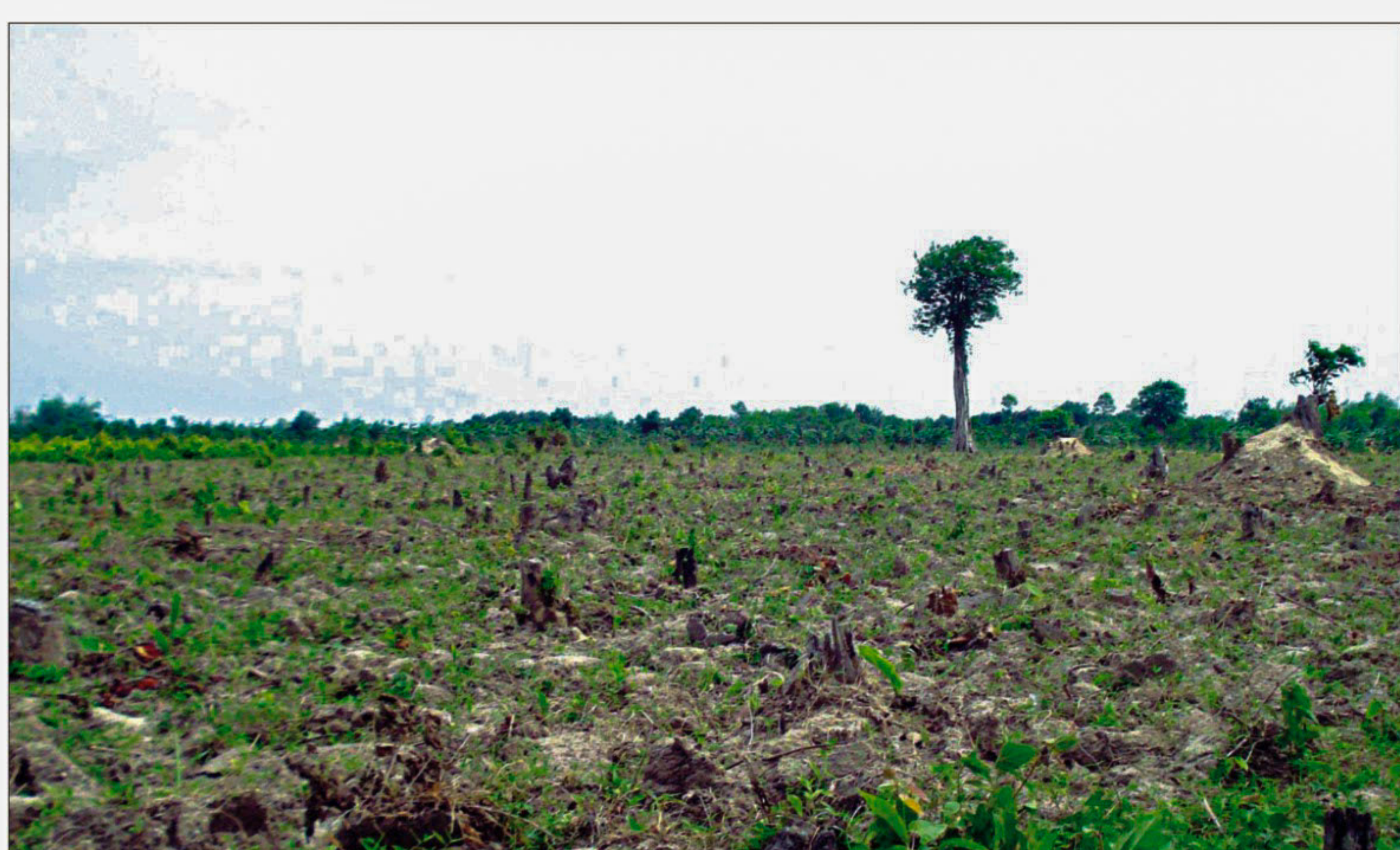
A vast swathe of Sal forest clear-cut for commercial fruit orchards in Modhupur of Tangail. Locals allege that influential ruling party people in collusion with some corrupt forest department officials wiped out 250 acres of such forest in the last one year for the purpose. The photo was taken recently.