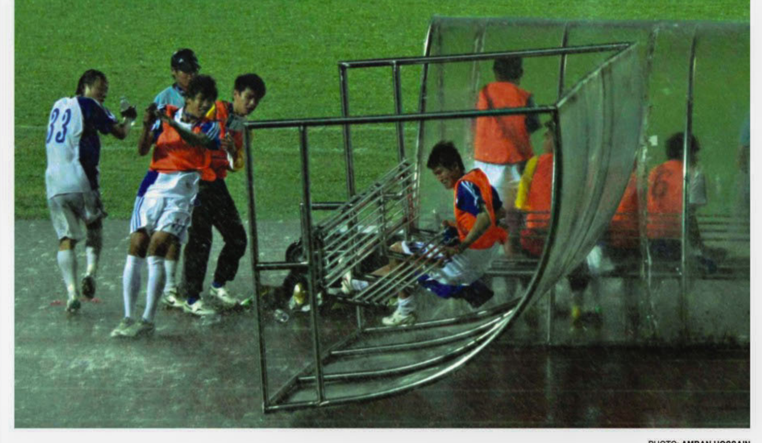
BLOWN AWAY, BUT NOT TOO FAR: Hasus NTCPE players struggle to stay on their feet as the strong wind blew away part of their dugout at the Bangabandhu National Stadium last evening. The storm came to life with ten minutes of the Hasus-Abahani match left but it didn't deter the visitors who held on to a goalless draw against the hosts.