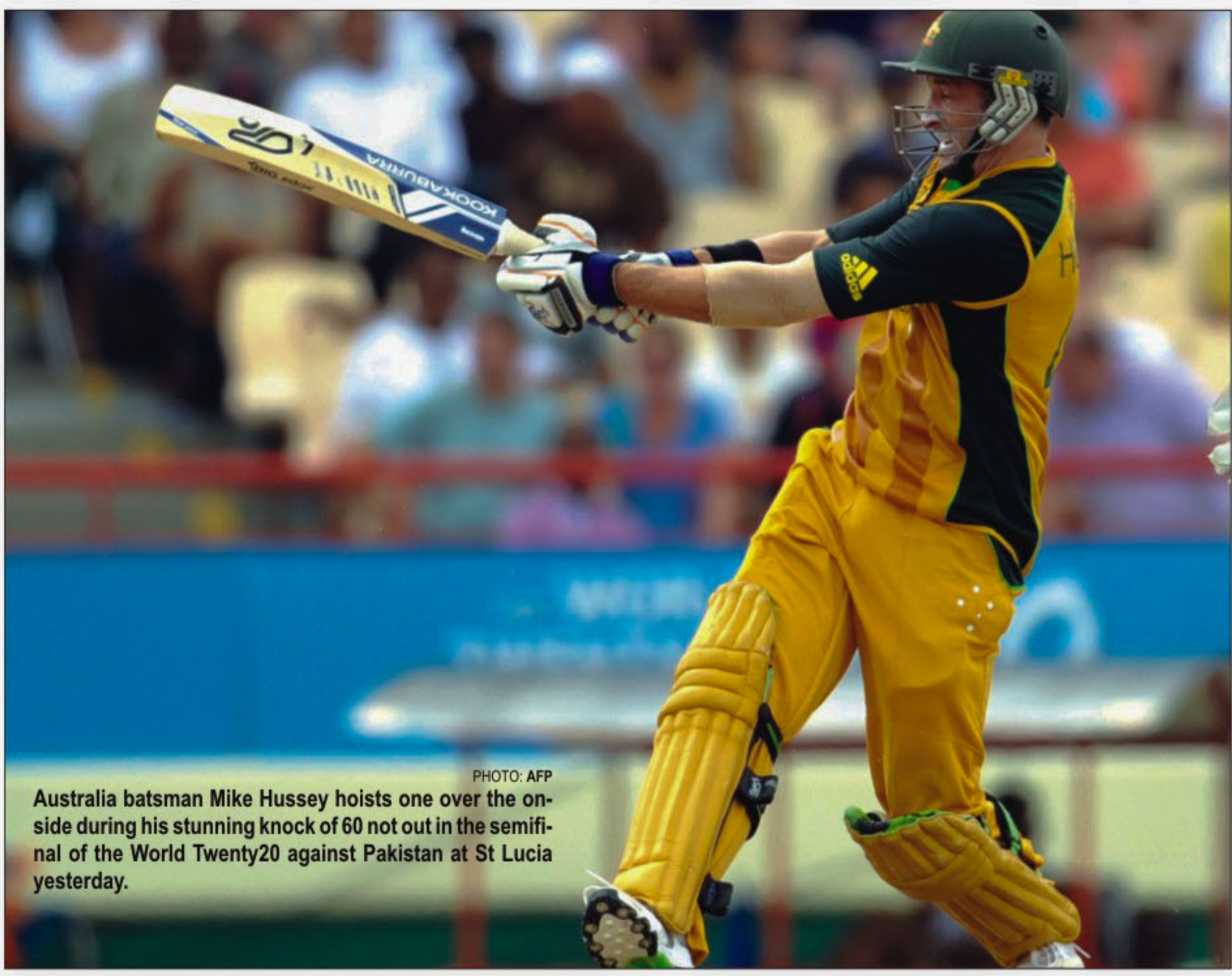
Australia batsman Mike Hussey hoists one over the on-side during his stunning knock of 60 not out in the semi-final of the World Twenty20 against Pakistan at St Lucia yesterday.