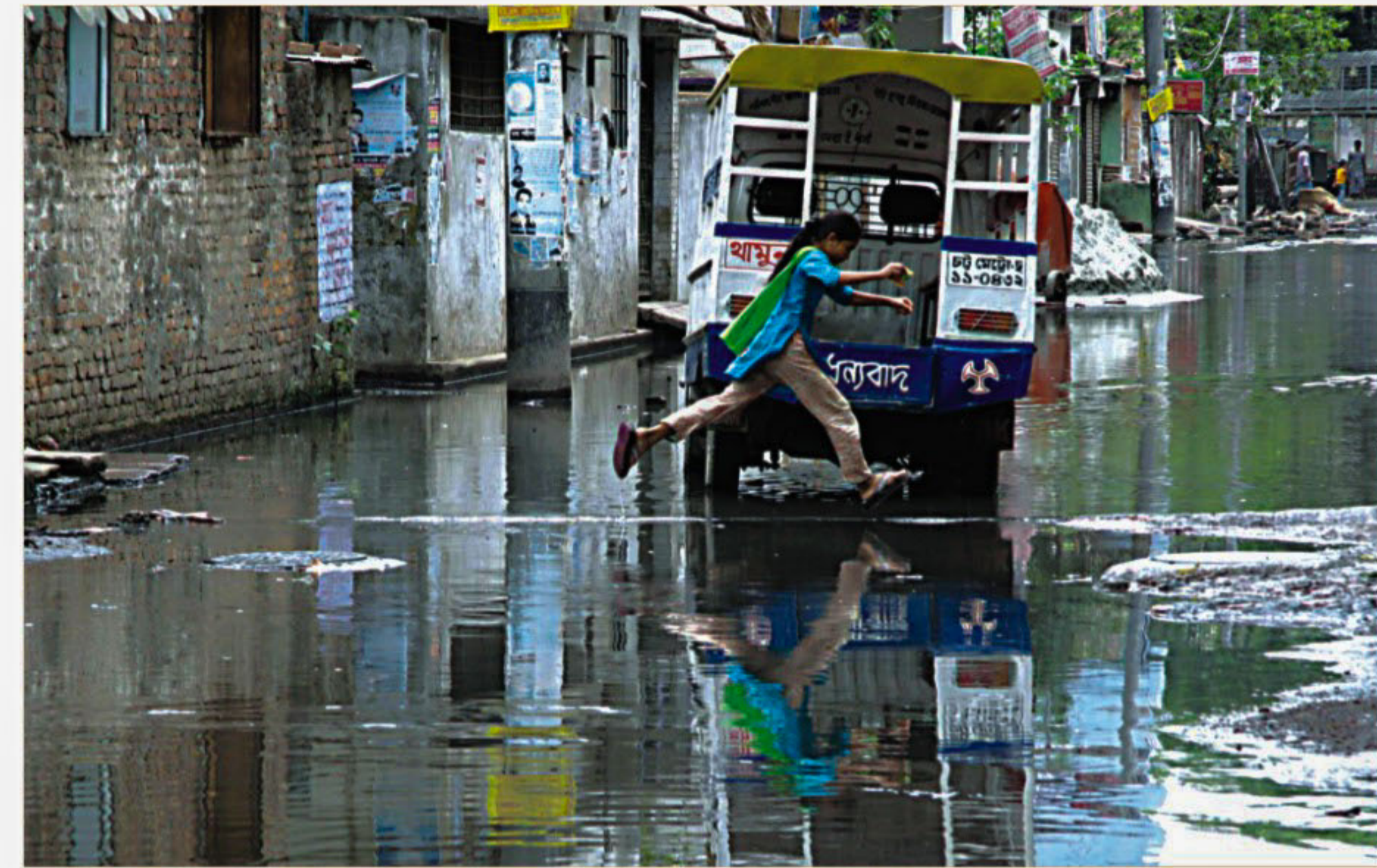
Waste of tanneries and sewage have been flooding Moneshwar Lane in Hazaribagh in the capital for the last three months rendering the lane unusable.

powered meeting will fix the principles and strategies for implementing the initiative. The official added the meeting would formulate detailed guidelines whether all schools and colleges included in the MPO would come under this initiative. The finance minister, education minister, the prime minister's adviser for finance and other high officials will attend the meeting, which will soon discuss the matter. Planning ministry sources say the prime minister in her handwriting issued the directive on April 20 while presiding SEE PAGE 15 COL 6