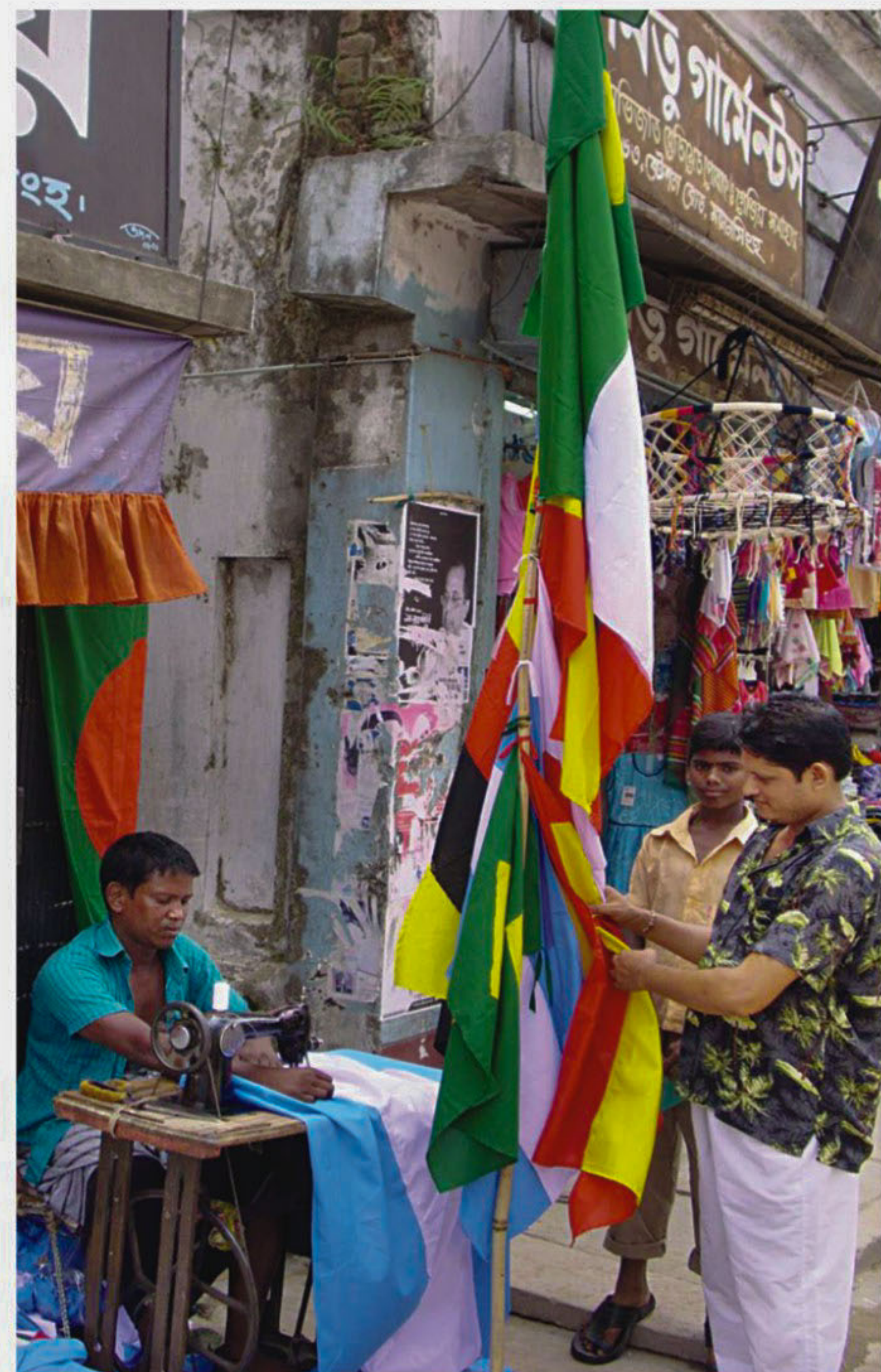
With the World Cup 2010 less than a month away football fans in Bangladesh are getting ready for the biggest show on earth. The picture snapped in Mymensingh on Thursday shows a football fan searching for the flag of his favourite team while a tailor sewing an Argentina flag. Argentina and Brazil are the two most followed teams in Bangladesh.

Arsenal's rejection of Gallas's demands could pave the way for a move to Paris Saint Germain in the French first division.