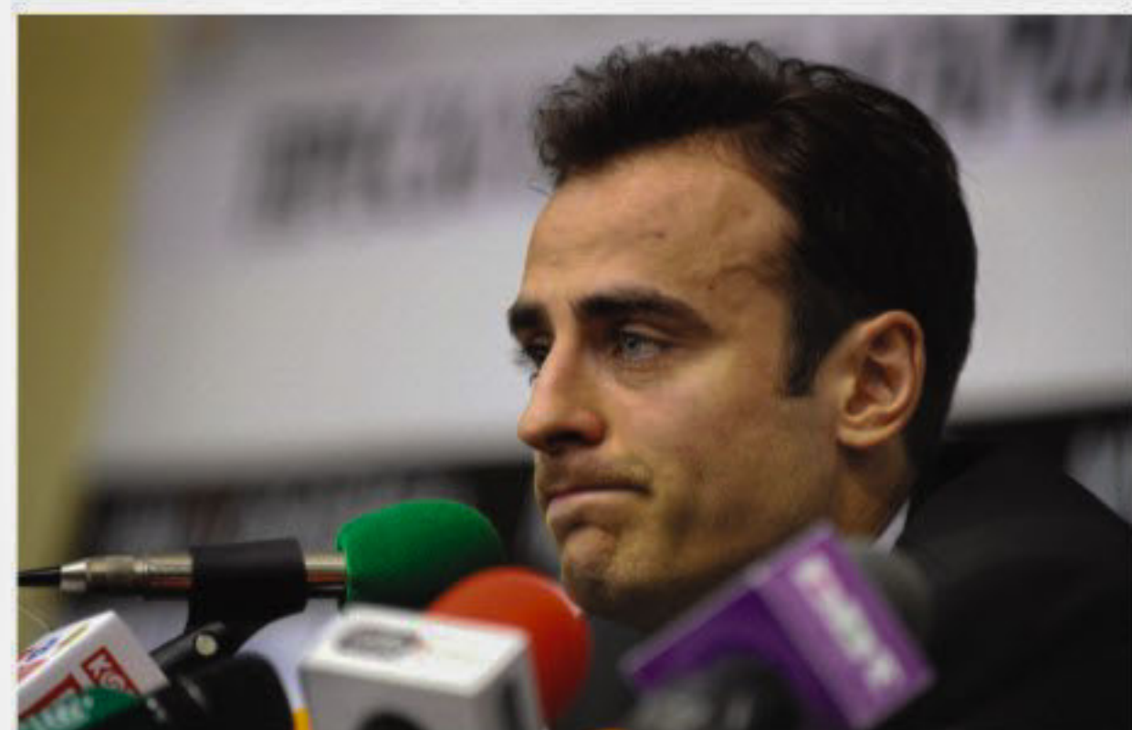
Manchester United's Bulgarian striker Dimitar Berbatov addresses a press conference in Sofia on Thursday. Berbatov announced his retirement from international football.

But he said on Thursday he was happy at United, who finished runners-up to Chelsea in the Premier League this year, and wanted to remain at the Old Trafford club.