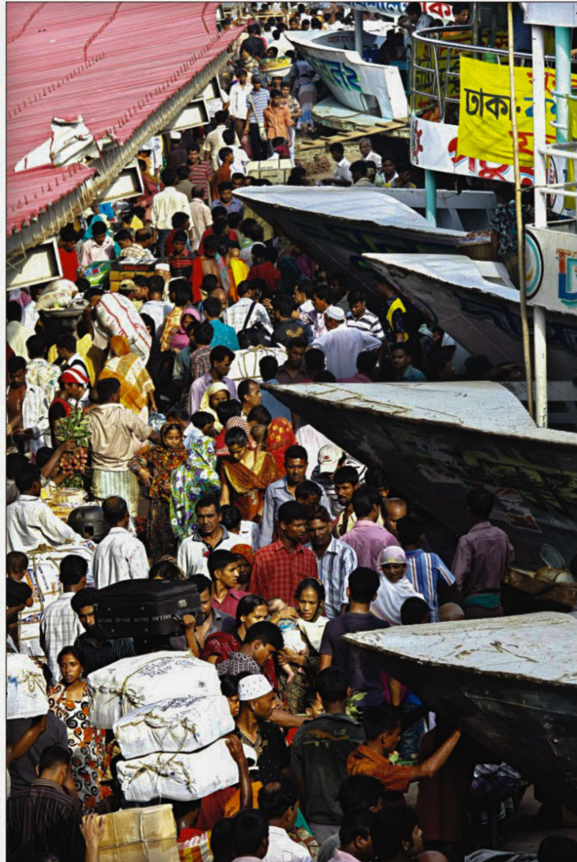
Passengers throng Sadarghat Launch Terminal yesterday, after the ongoing water transport workers' strike lost almost all its steam on the sixth day.