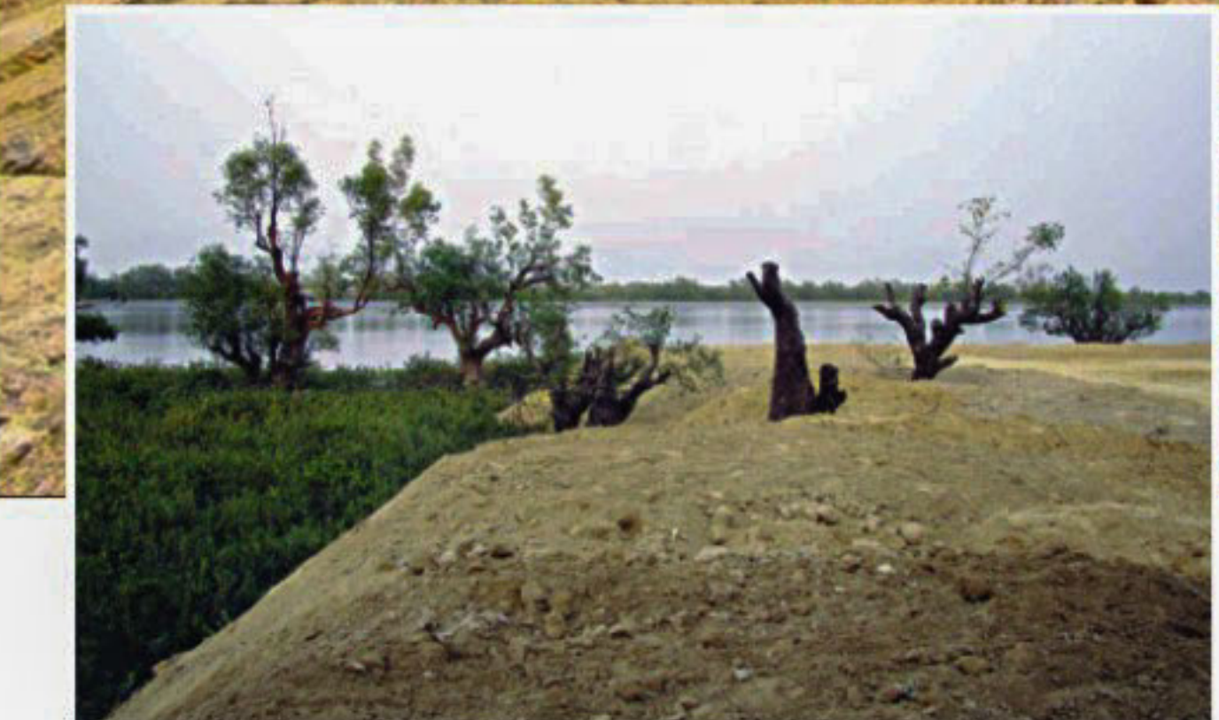
Almost flattened Buddha Jadi hill in Teknaf. The hill was cut for soil by a private company that manages Teknaf land port. Inset, earth from the hill is used to expand the port by the Naf River, clear cutting a mangrove forest. An official of the company said they already cut several other hills for the purpose.