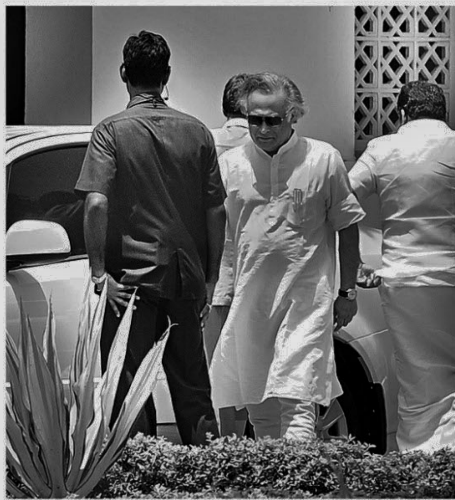
Indian Environment and Forest Minister Jairam Ramesh (C) comes out from Prime Minister house after a Cabinet meeting in New Delhi yesterday. Ramesh, in the eye of a storm over his remarks on China, has offered to quit, Govt sources said. Ramesh has, instead, been told by the Congress high command to stop speaking out of turn, and to "stay within party limits." In China last week, Ramesh said Chinese companies looking to enter India were being met with "alarmist" and "paranoid" policies of the Home Ministry.

The prime minister, after going through Chidambaram's letter on the matter, telephoned Ramesh and made it clear that a member of his ministerial council cannot comment on the functioning of other ministries, that too on foreign soil, officials said.