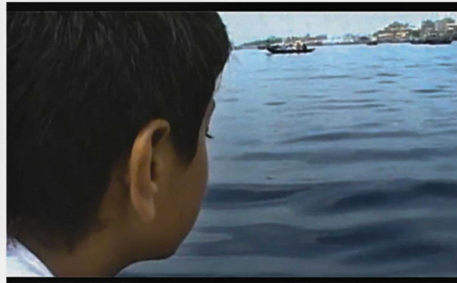
A still from "Innocence, Medium: Watercolour".