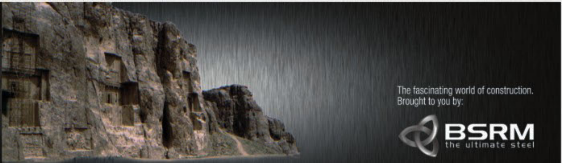
The fascinating world of construction. Brought to you by: BSRM the ultimate steel

Naqsh-e Rostam & Naqsh-e Rostam are four archaeological tombs belonging to Achaemenid kings that are carved out of the rock face. They are located 12 km northwest of Persepolis, in Fars province, Iran and are all at a considerable height above the ground.