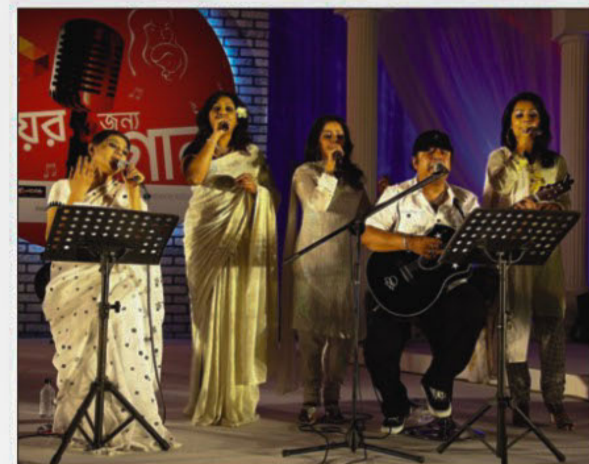
Artistes perform at "Ma-er Jonno Gaan".