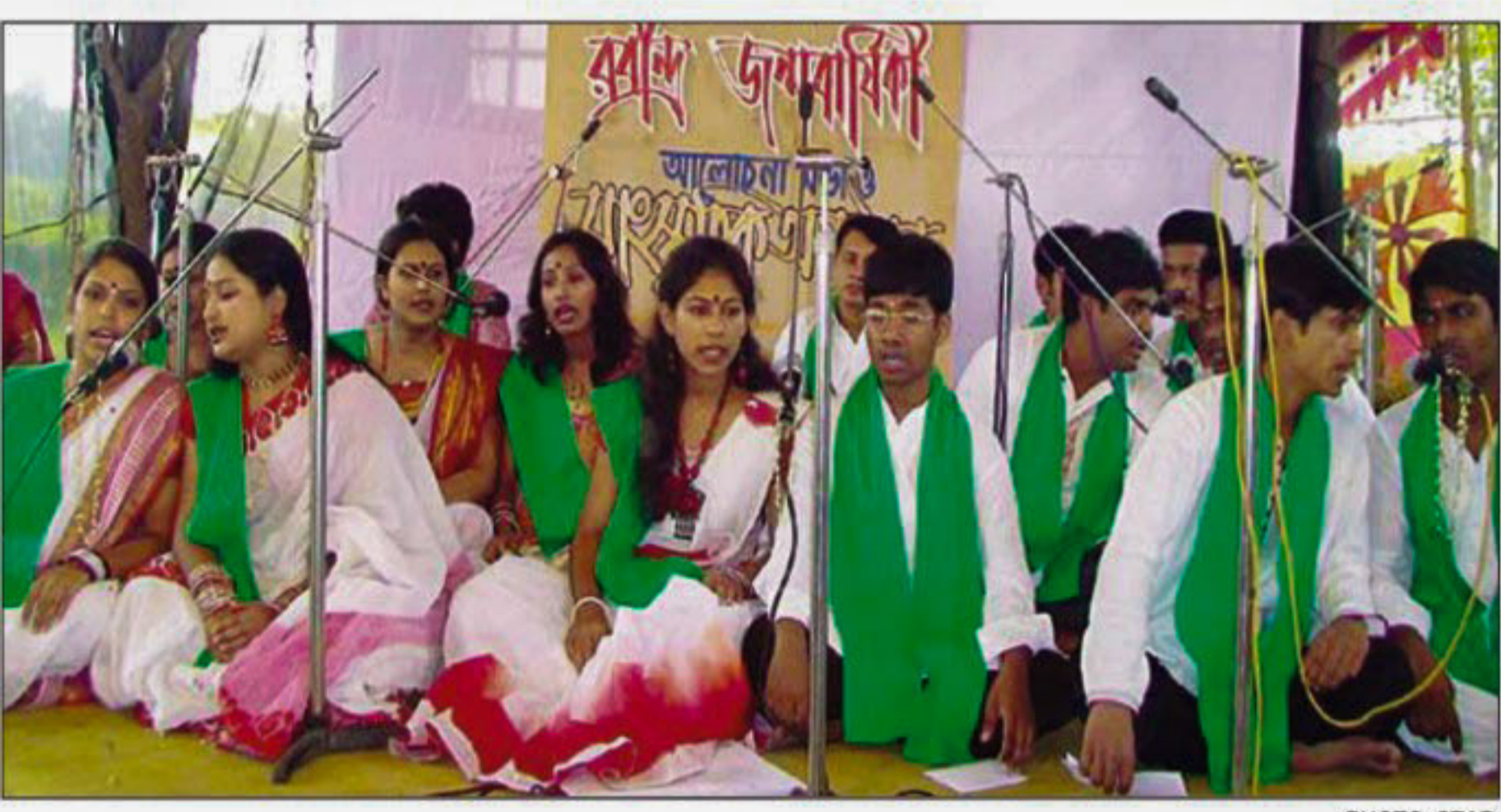
Students of Jatiya Kobi Kazi Nazrul Islam University sing at the celebration.