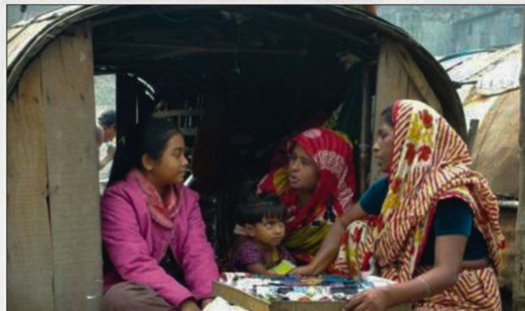
A scene from "Our Boat is Our Address".