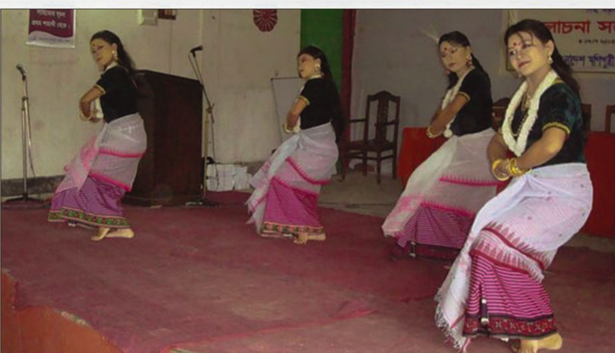
A Manipuri dance performance at the programme.