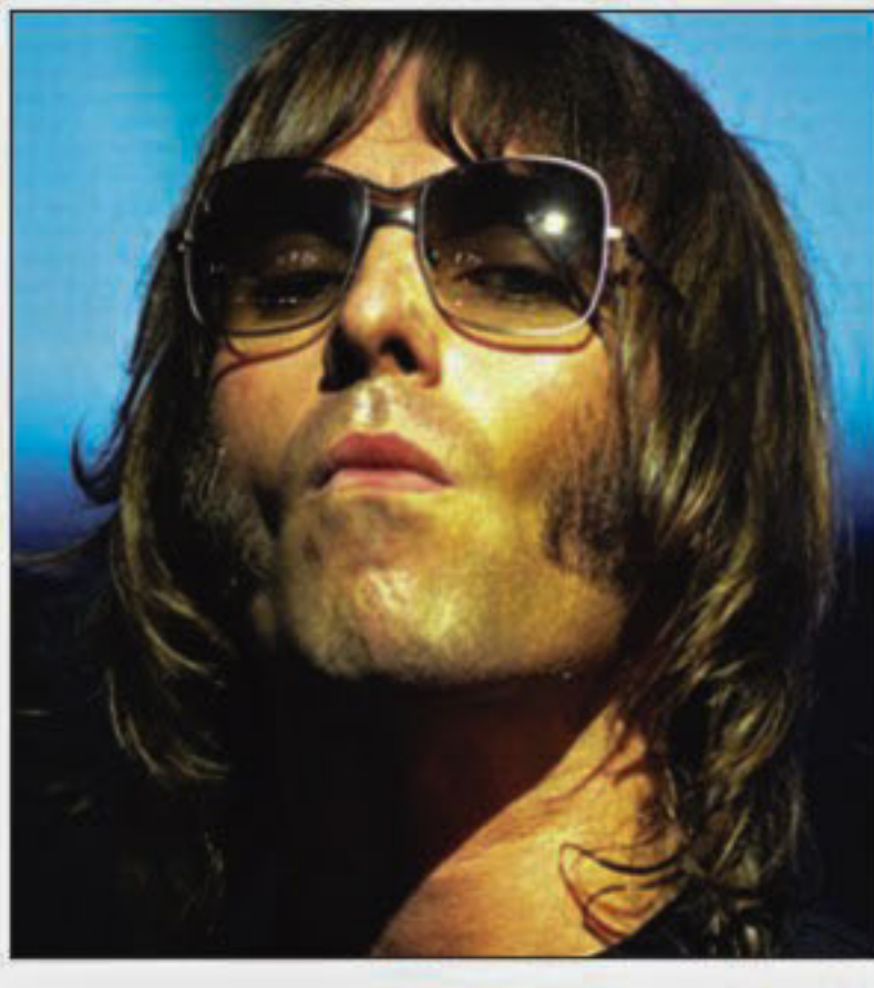
Oasis recorded a version of The Beatles' hit I Am The Walrus.