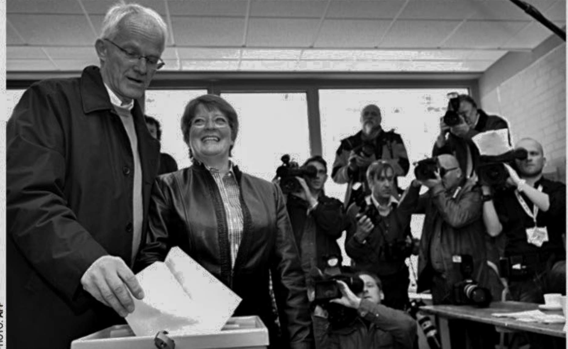
North Rhine-Westphalia State Premier Juergen Ruettgers (CDU) casts his vote as his wife yesterday in Pulheim. A survey shows that voters are angry at the bail-out for Greece which could hand Chancellor Angela Merkel's CDU party a bitter defeat.

With the economic crisis dominating the campaign, Merkel tried to delay a decision on the hugely unpopular rescue package for Greece until after the poll, but failed.