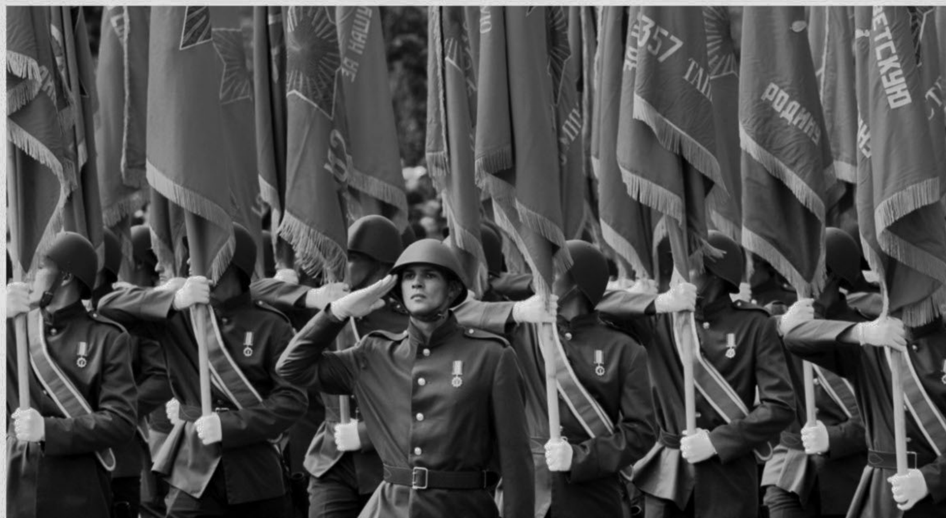
Ukrainian soldiers, wearing Soviet Army uniforms and holding flags of a Soviet World War II unit, march in Kiev yesterday during a Victory Day parade, marking the 65th anniversary of the end of WWII.

In Portugal, all flights to the northern city of Porto were suspended until 1200 GMT Sunday, airport officials there said, after authorities had cancelled dozens of flights on Saturday.