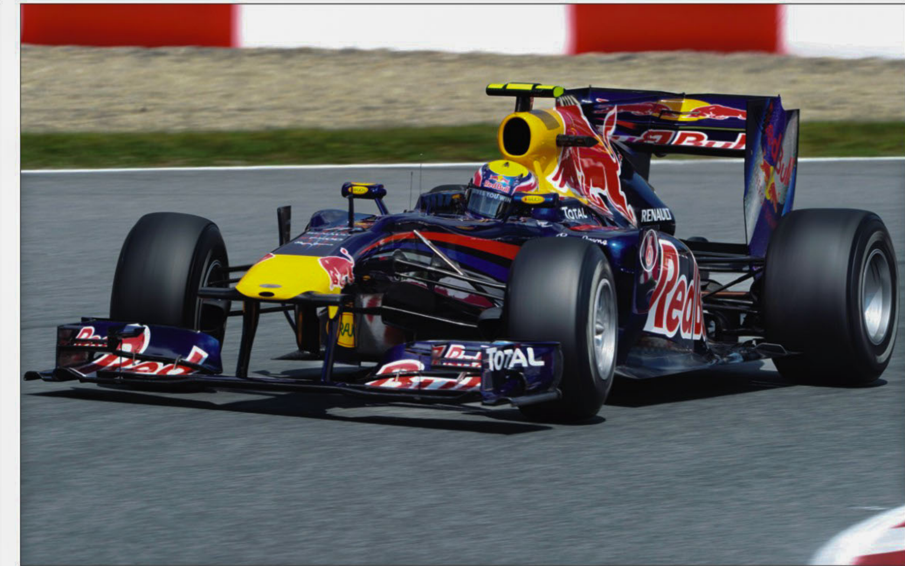
Australian driver Mark Webber races his Red Bull through a corner during the Formula One qualifying session for the Spanish Grand Prix at the Catalunya Circuit on Saturday.

They are five points from safety and if they fail to win or if Bologna and Lazio both win, they will be down this weekend.