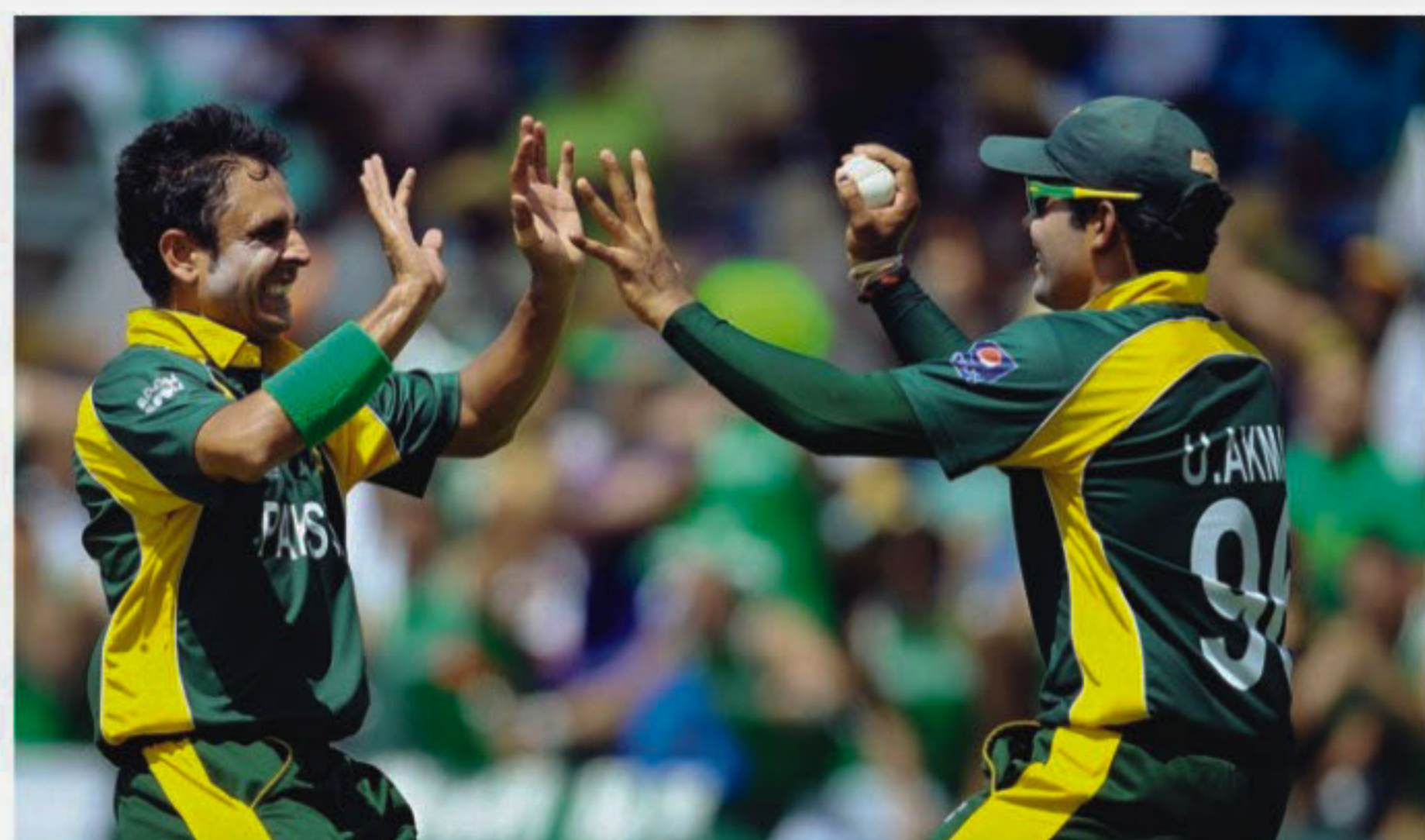
Pakistan left-arm spinner Abdur Rehman (L) exchanges high-fives with Umar Akmal after taking the wicket of New Zealand batsman Martin Guptill during their World Twenty20 match at the Kensington Oval on Saturday.