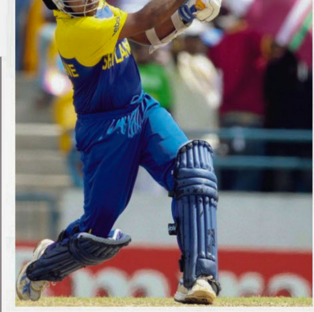
Former Sri Lanka captain Mahela Jayawardene has so far made the ICC World Twenty20 a tournament of his own. Here he plays one over mid-wicket during a Super Eights match against West Indies on way to scoring 98 at the Kensington Oval on Friday.