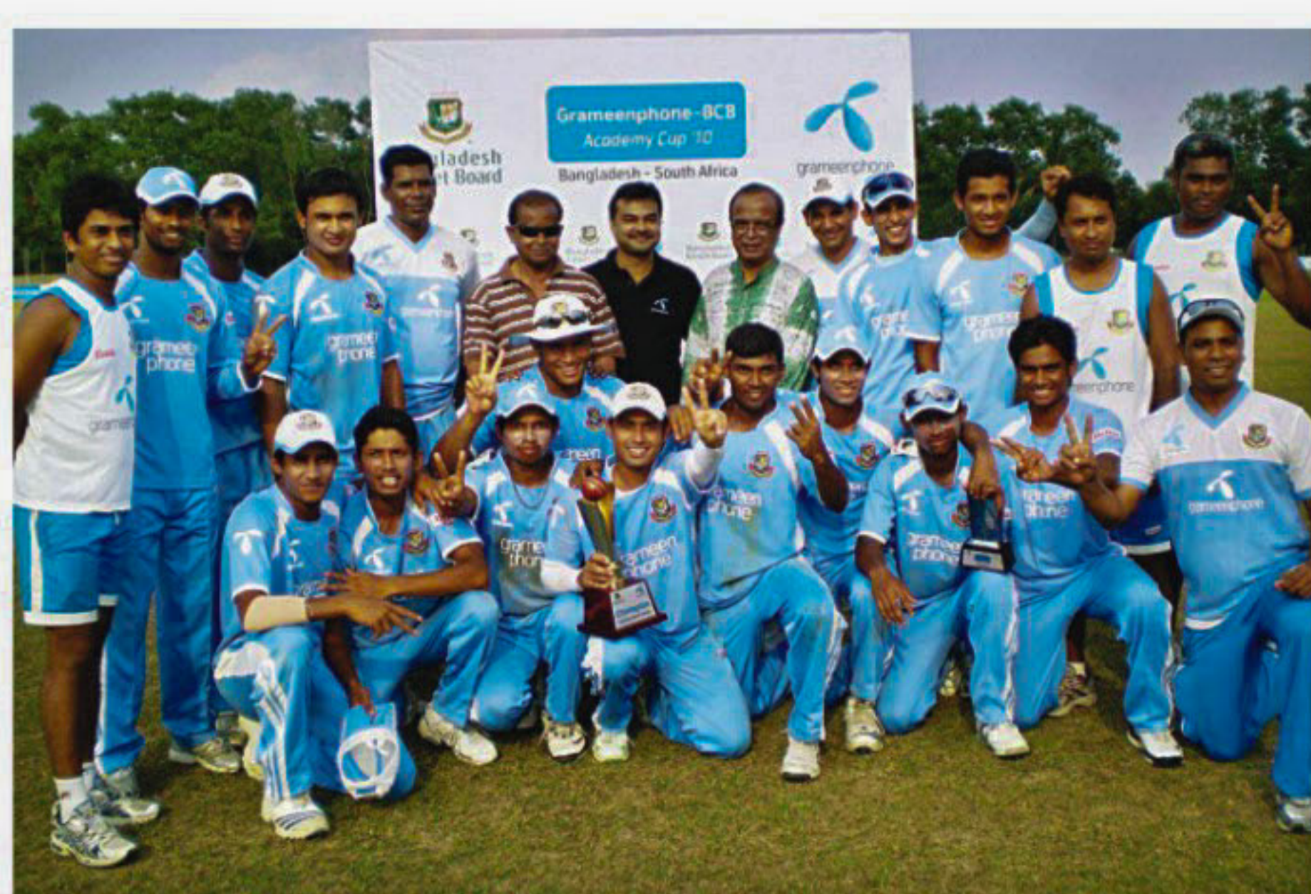
Players and officials of GP-BCB Academy celebrate after their 2-1 series win against South Africa Academy at the BKSP in Savar where the home side won the final game by 67 runs.