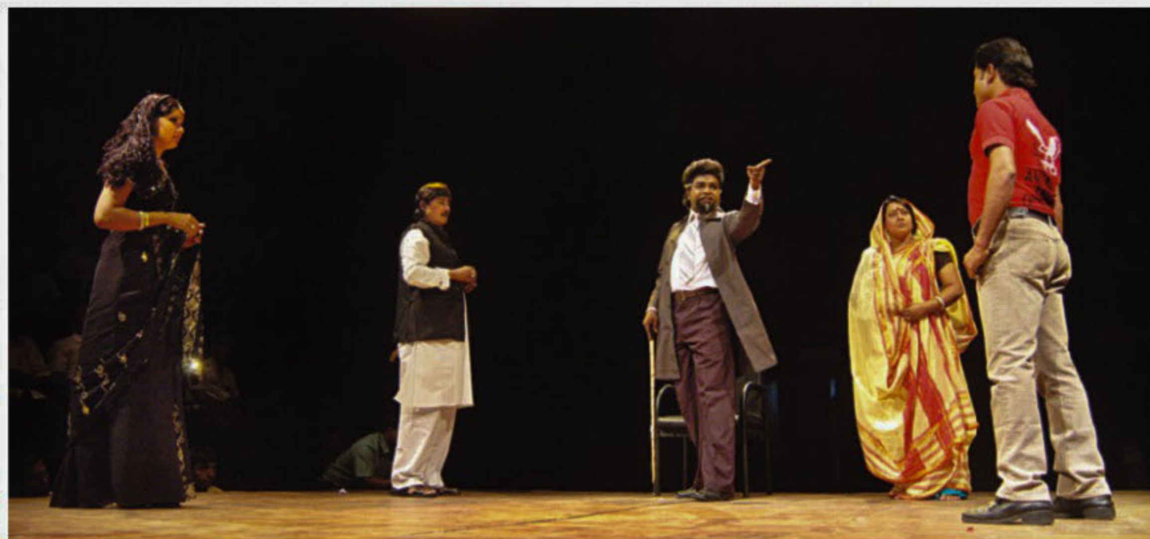
The melodramatic 'pala' depicts the upheavals of a middle class family.