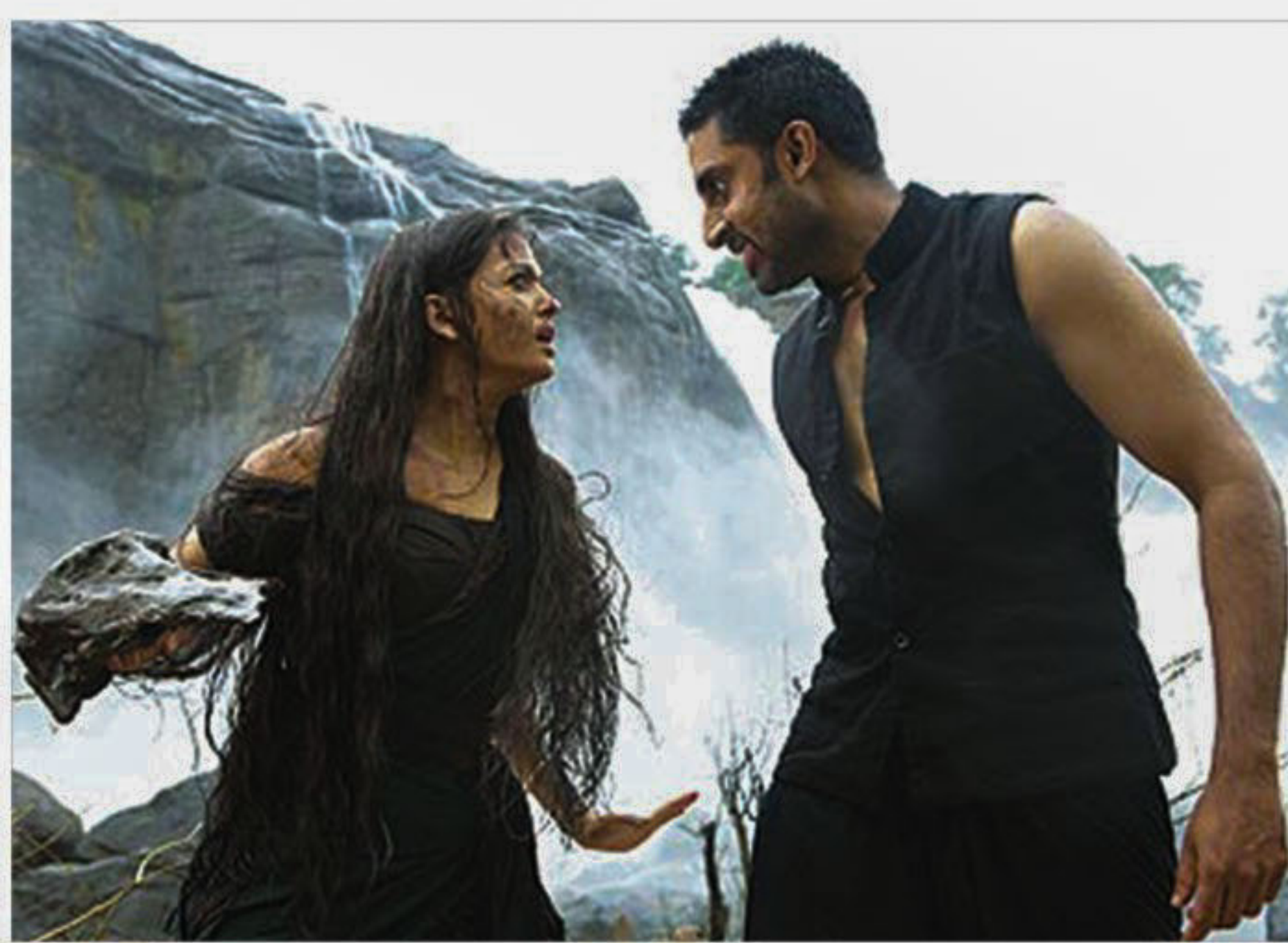
Aishwarya and Abhishek Bachchan in the film.

One has to admire Abhishek Bachchan for being so incredibly frank.