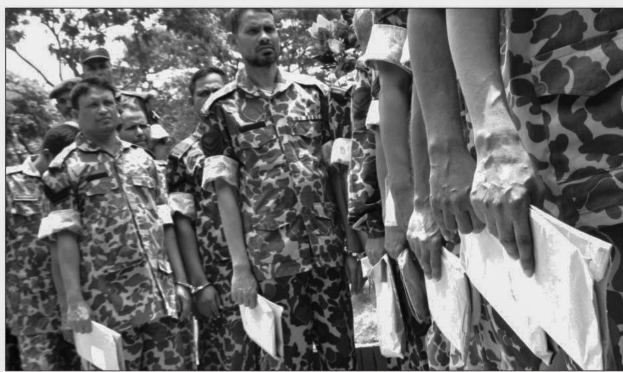
Alleged mutineers of the Rifles Security Unit were produced before the BDR special court at Pilkhana in the city yesterday. (Story on Page 1)

Police said the robbers stormed into the house and held the inmates of the house hostage at firearms and sharp weapons and broke open the lockers.