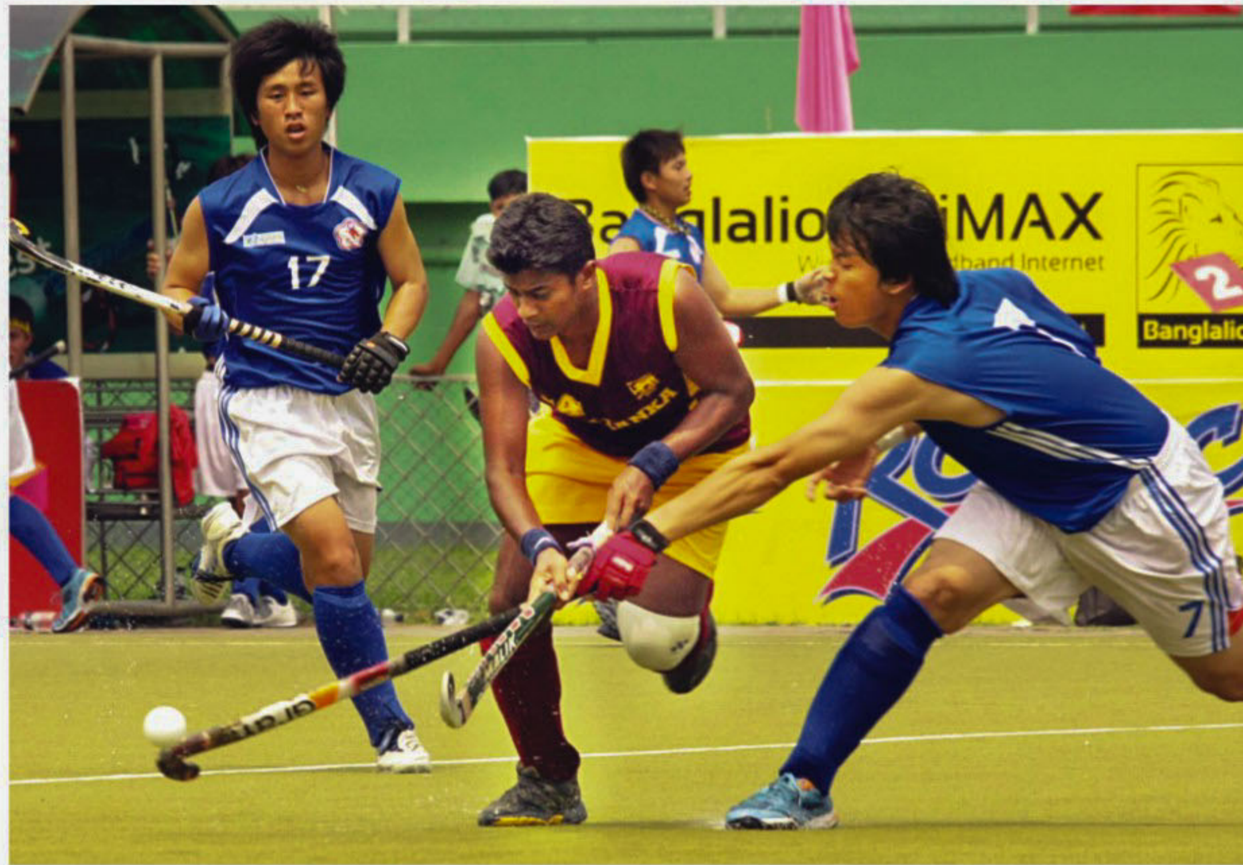
Action from yesterday's Robi Asian Games hockey qualifiers match between Sri Lanka and Taipei at the Maulana Bhasani National Hockey Stadium.