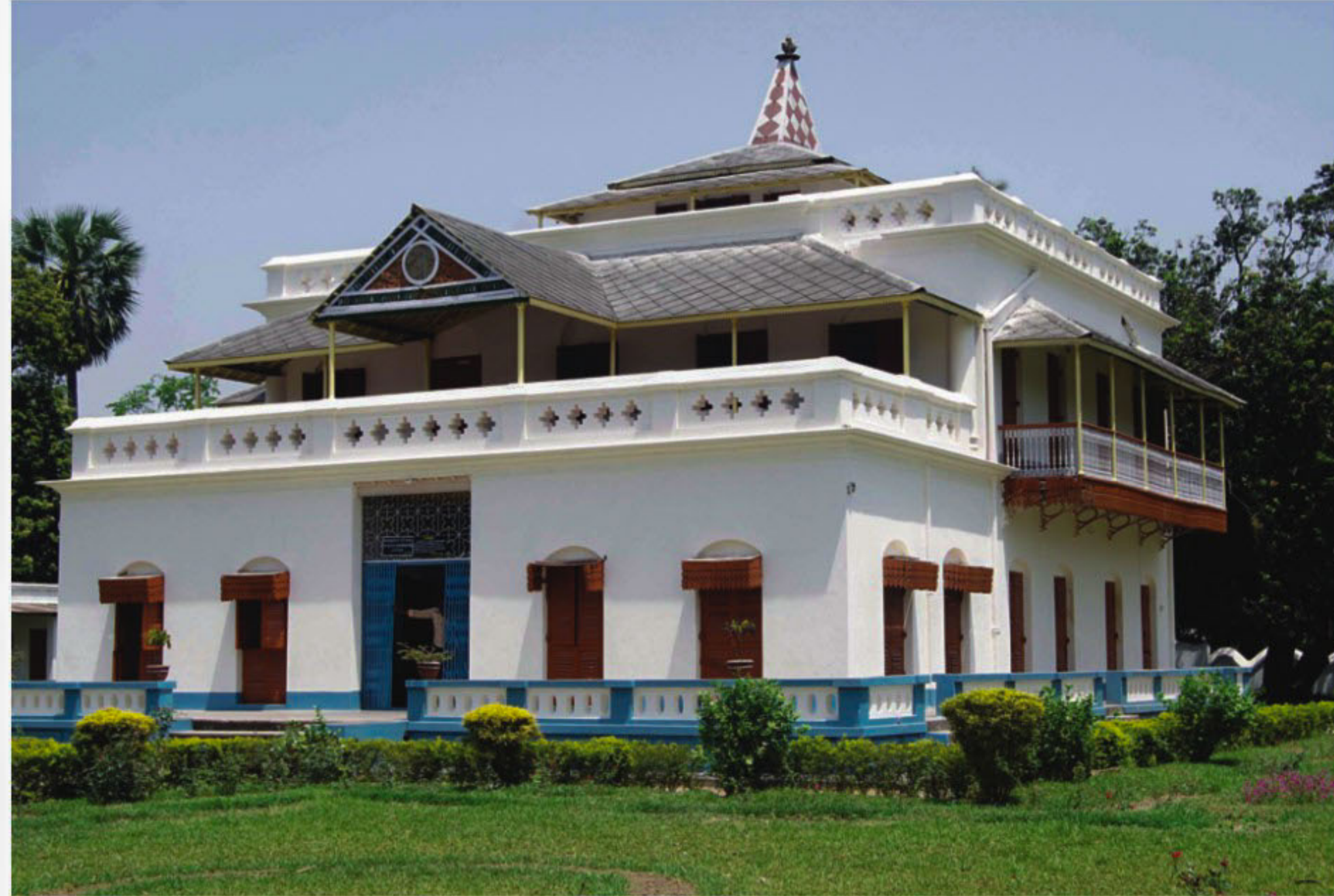
The Tagore Kuthibari in Shilaidaha.