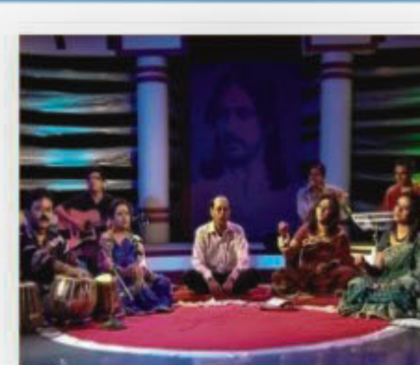
Tumi Kemon Korey Gaan Koro Hey On Baishakhi TV at 9:50 pm Musical programme on Tagore Birth Anniversary