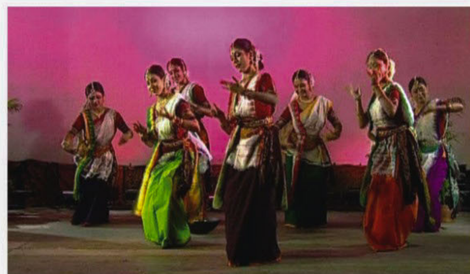
A scene from the programme.