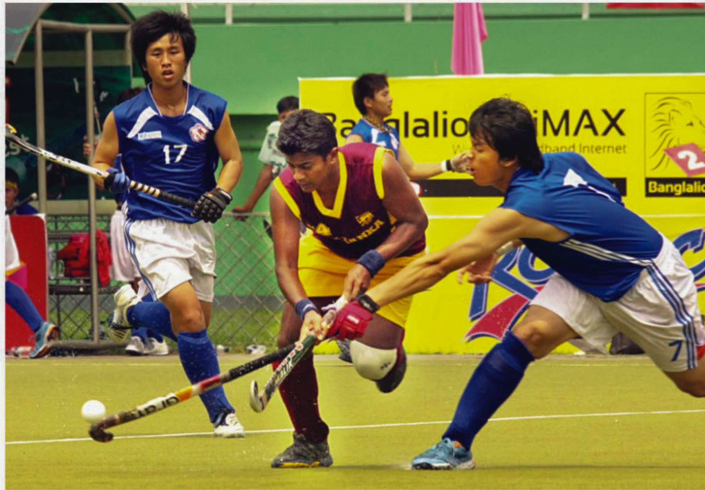
Action from yesterday's Robi Asian Games hockey qualifiers match between Sri Lanka and Taipei at the Maulana Bhasani National Hockey Stadium.