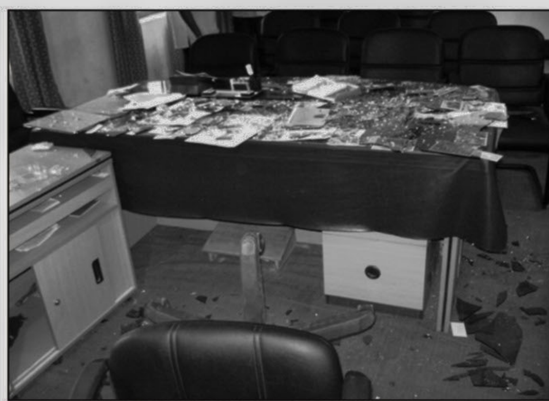
Intra-party opponents ransack the office of Durgapur upazila parishad Chairman Abdul Mazid, also an Awami League (AL) leader, as clashes between two rival groups of the ruling party yesterday left two persons injured.

We are looking for a medium size woven top (blouse/shirt) manufacturing factory located in Dhaka or Chittagong with minimum capacity of 2 lac pcs per month. Interested parties are requested to contact to the below mentioned details: E-mail a_zaman@gordonhicks.com.hk Cell #0085223563929