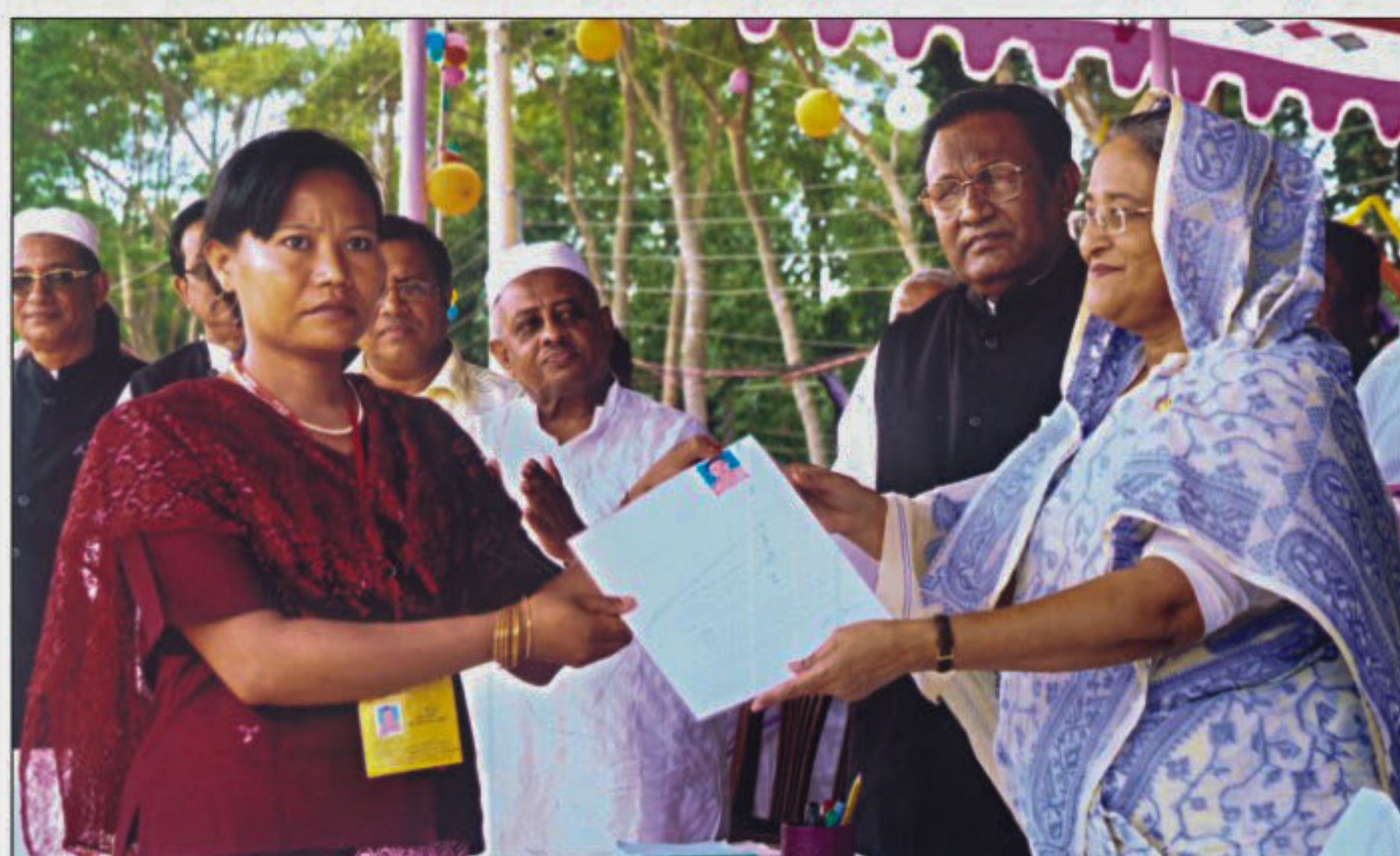
Prime Minister Sheikh Hasina hands over a certificate to a participant of the government's National Services Programme on the Barguna Circuit House premises yesterday.

Hasina said without development of Barisal region, the much dreamt-of balanced development for the whole country cannot be achieved.