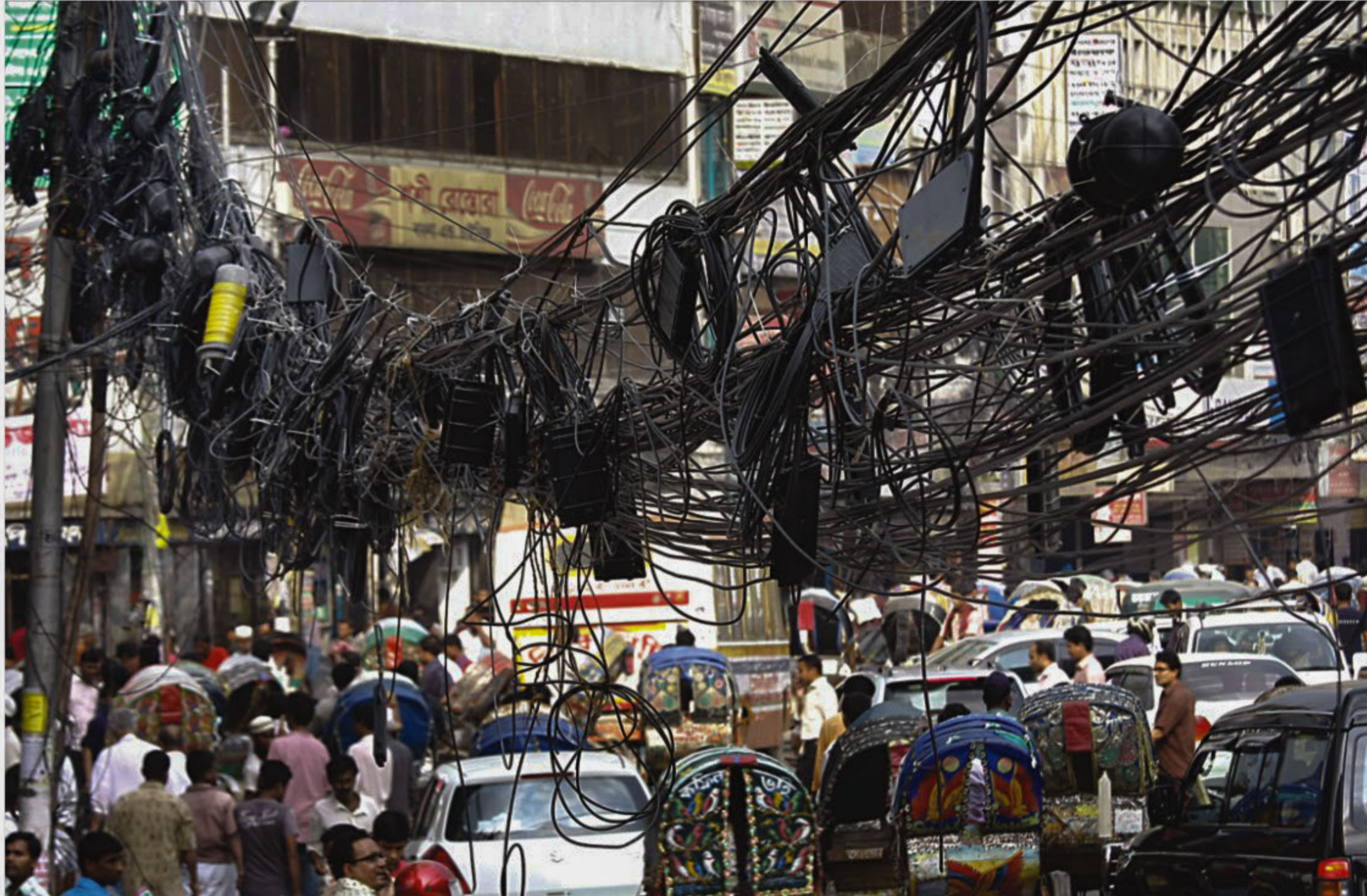
A common scene: Tangled cables in our midst.

Dhaka city has been jam-packed with the overhead cables ever since Bangladesh got connected with the submarine cable that helped people log on to the internet.