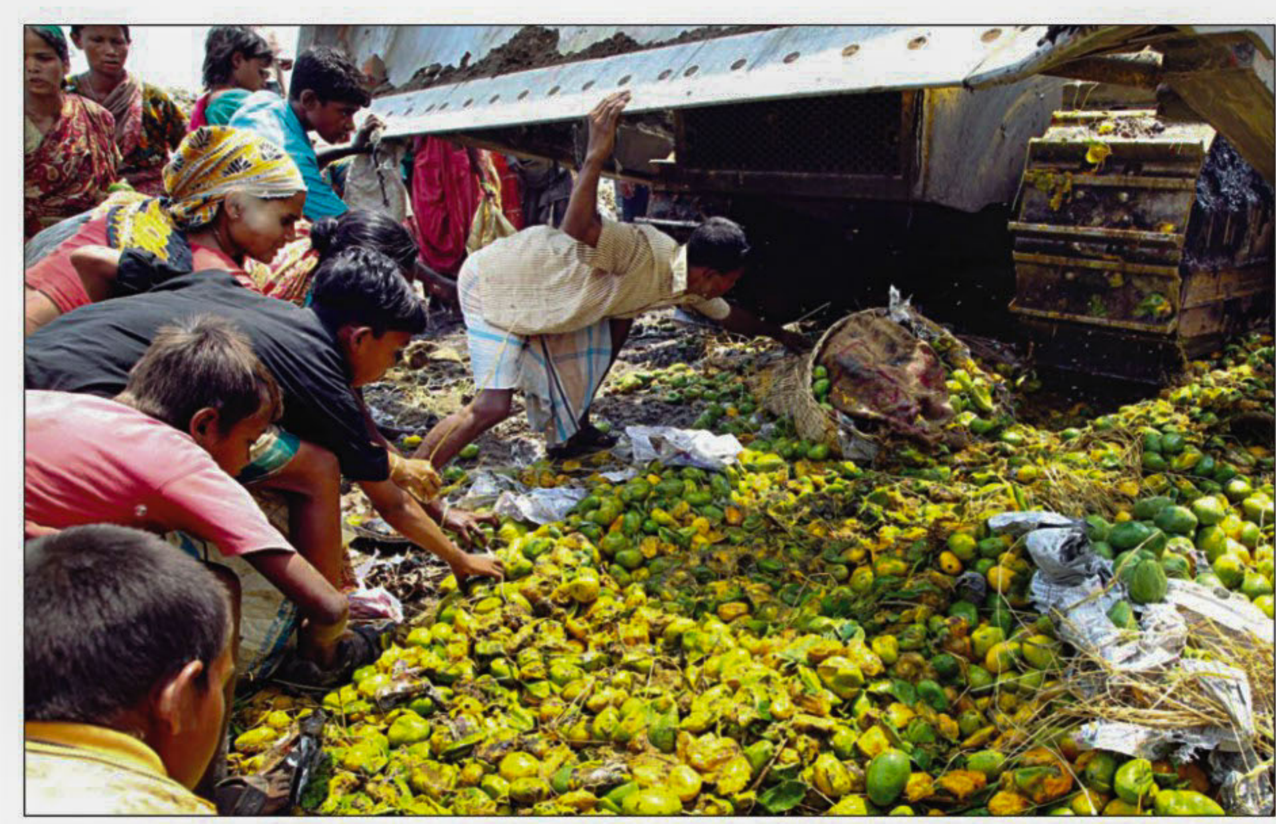
People frantically trying to pick as many mangoes as they can at Dhaka City Corporation's Jatrabari garbage dump as a tractor takes a pause from crushing them yesterday. A mobile court dumped the chemical soaked mangoes there for destruction after seizing those raiding a wholesale fruit market in South Jatrabari earlier in the day.