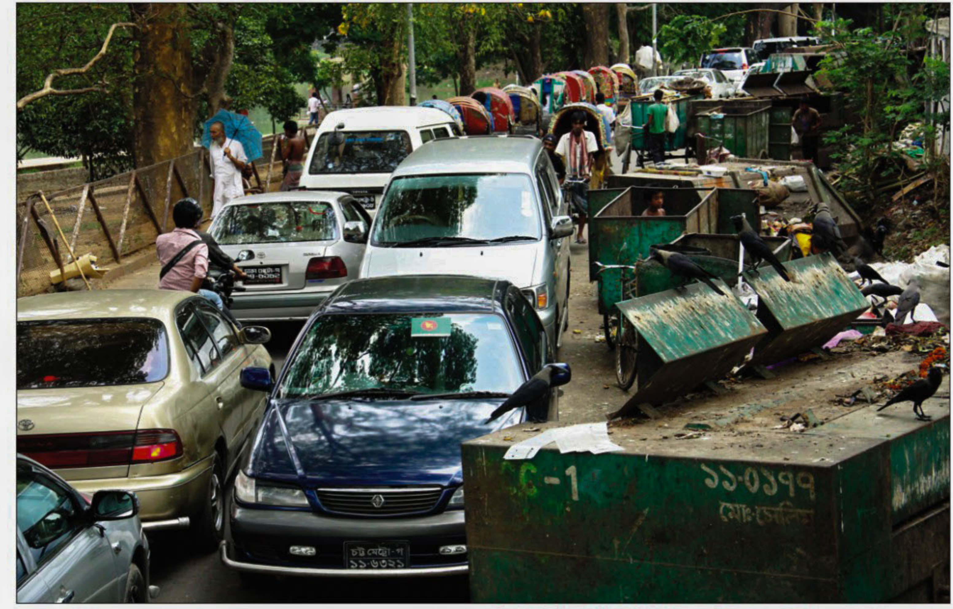
Dumpsters haphazardly line the lakeside section of Road no 8A in Dhanmondi of the capital, narrowing down the street and creating traffic jams every day. The bins also constantly spread foul odour in the neighbourhood.

STAFF CORRESPONDENT India yesterday reassured Bangladesh that it would fully stop the killings of Bangladeshis by the Indian Border guards on the frontier. The assurance came after Indian High Commissioner to Bangladesh Rajeev Mitter had called on Home Minister Sahara Khatun at her Secretariat office last morning. "He (Mitter) reassured us that the killings would come to an end," Sahara told reporters. She added that more meetings between the two countries are necessary for this purpose. SEE PAGE 15 COL 6