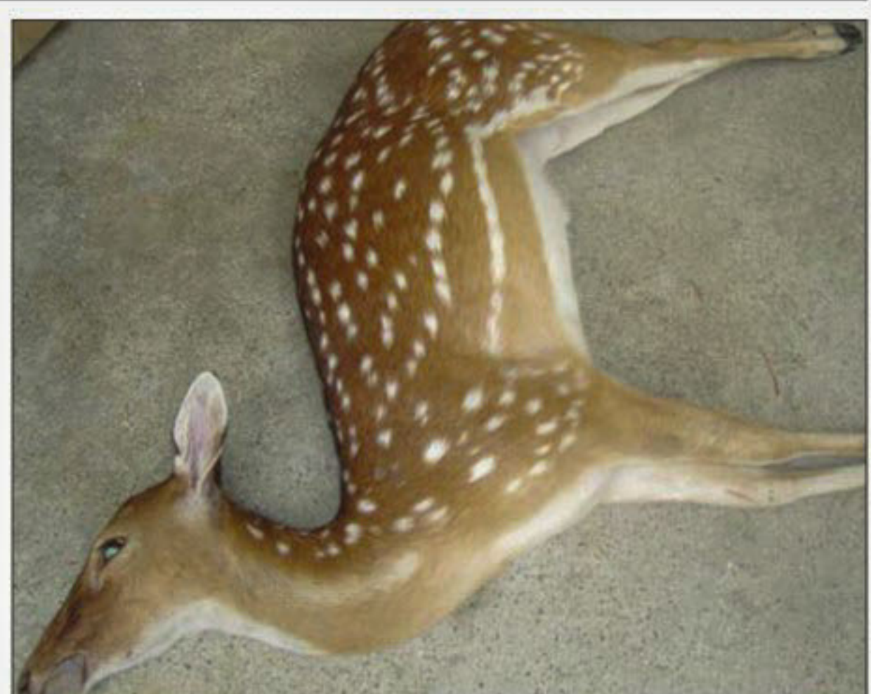
One of the two spotted deer, captured by villagers adjacent to Sharankhola Range of the Sunderbans East Zone yesterday morning, was released to the Sundarbans but the other died when the two were being taken to Sharankhola station after villagers handed them over to the Forest Department officials.