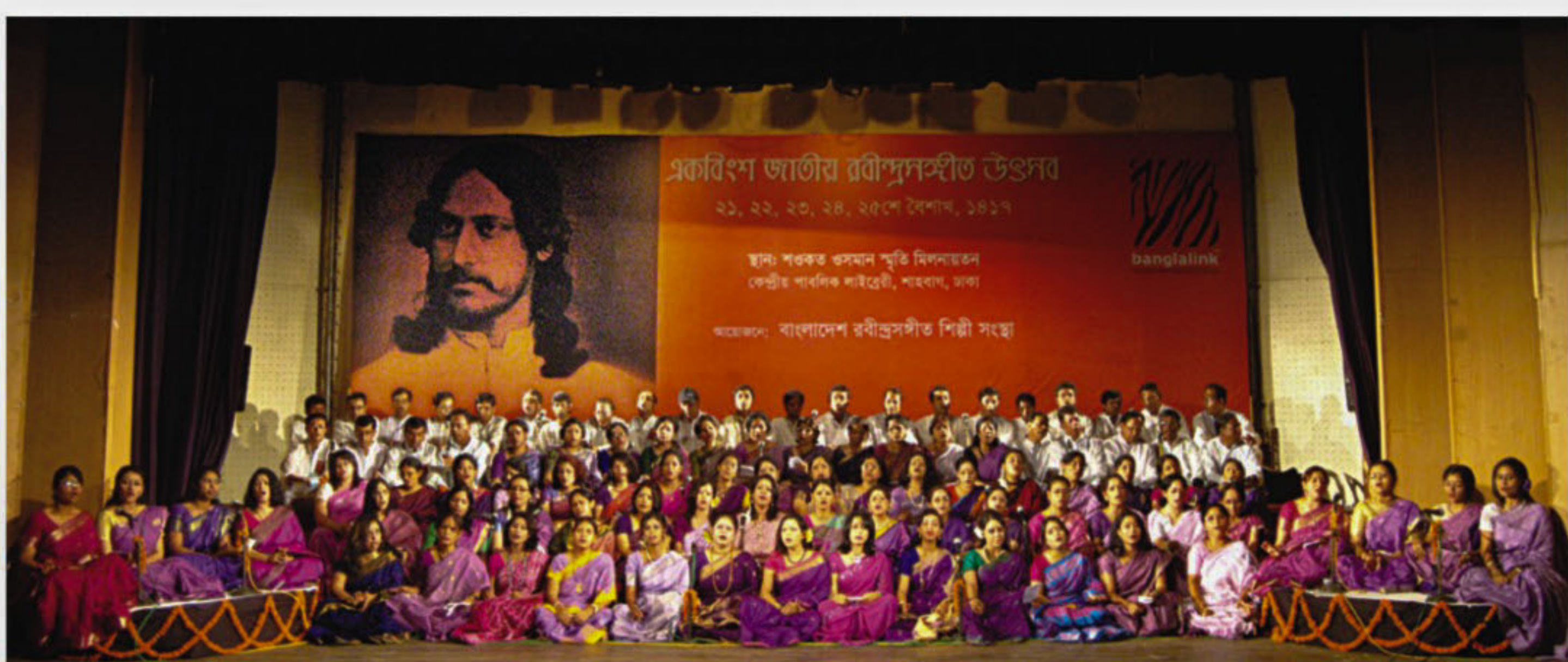
Members of BRSSS during a group rendition.