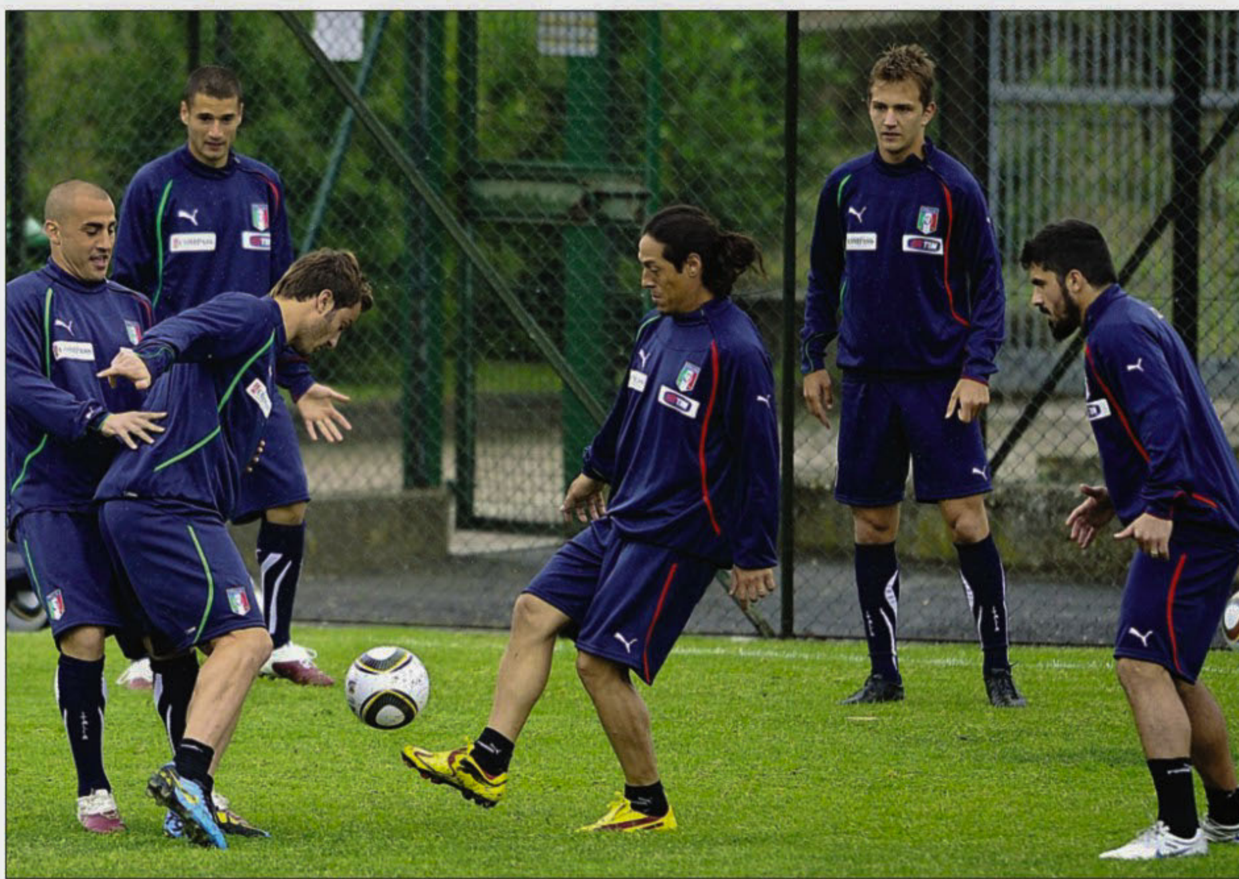
Italy midfielder Mauro Camoranesi (C) kicks the ball surrounded by teammates during a training session at Rome on Tuesday.

"My assistants and I have seen a lot of Ruud playing recently. We don't think it would be useful to call him up at the first step but that does not mean that he's out of the picture," the coach said.